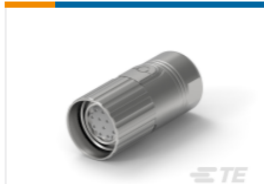
TE Part #ASA013F11410235000 623 PLUG