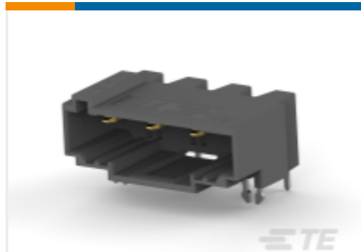
TE Part #2-2271457-4 D3950 HDR 4POS 1ROW Y KEY