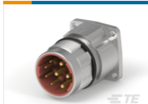
TE Part #BEA120M42000200000 923 RECEPTACLE, SPEEDTEC-READY