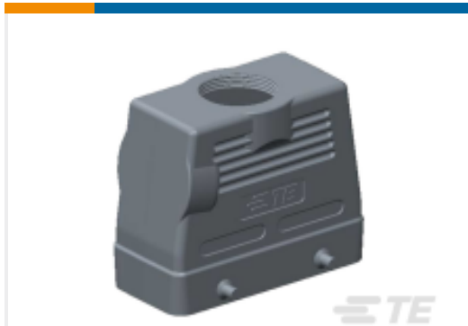
TE Part #T1240160132-000 H16B-TGH-M32