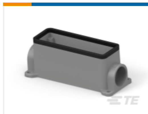
TE Part #T14X0240121-000 H24B-SGR-PG21