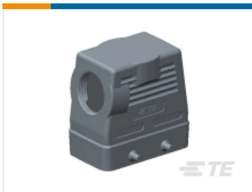
TE Part #T1230160121-000 H16B-TSH-PG21