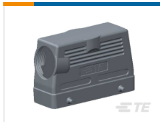
TE Part #T1230240121-000 H24B-TSH-PG21