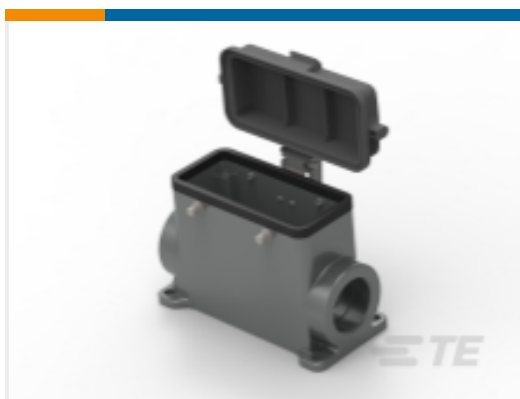
TE Part #T1490160121-000 H16B-SDRH-BO-PG21