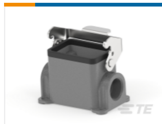
TE Part #T1610063116-001 H6B-SGR-PG16