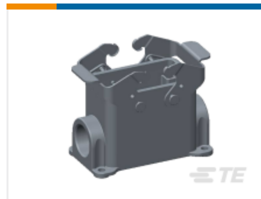
TE Part #T1440102116-000 H10B-SGR-PG16