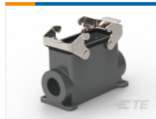
TE Part #T1470162121-000 H16B-SGRH-PG21