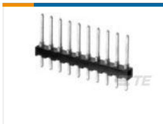
TE Part #87221-5 06 MODII HDR SRST UNSHRD .150