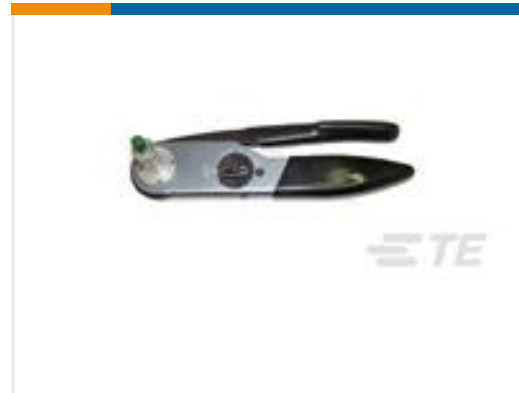
TE Part #HDT-48-00 CRIMP TOOL, HAND