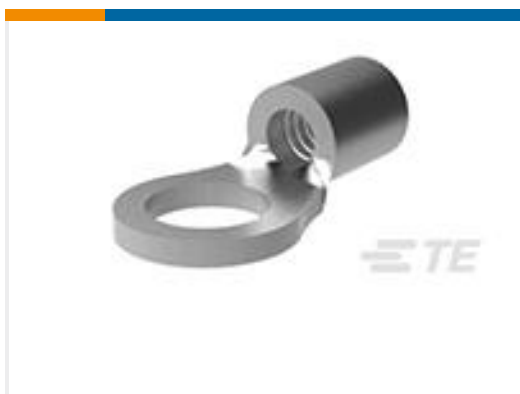
TE Part #31164 TERMINAL,BUDG R 16-14 1/4