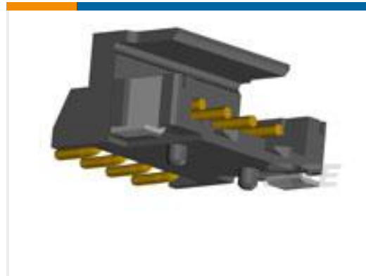
TE Part #292173-6 CT BOX HDR H SMT 6P O/TAPE BLA