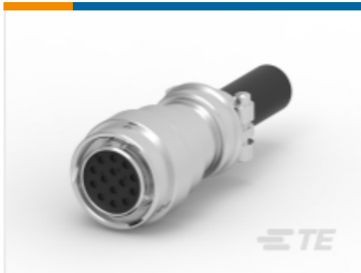
TE Part #HD36-18-14SN-059 PLG,14P,AL,N, CBL CLMP BT, DRAIN, 16,S,MC