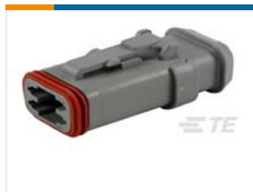
TE Part #DT06-4S-CE04 PLG, 4P, GRY, E, XCAP