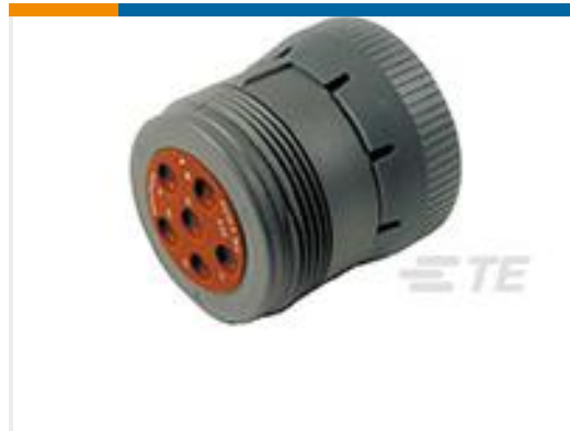
TE Part #HD16-6-96S PLG, 6P, GRY, N, THRD, 16