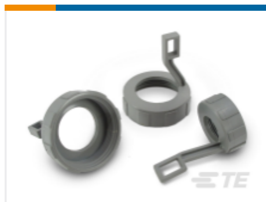
TE Part #M902-2162 DEUTSCH HD10 Backshells