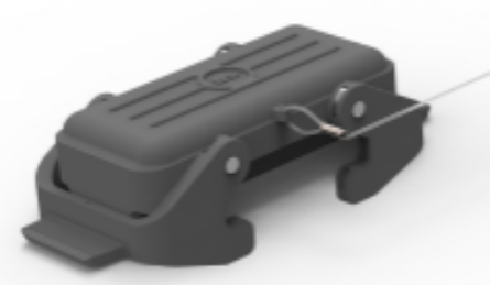
TE Part # T1010161200-000 H16B-KDTP