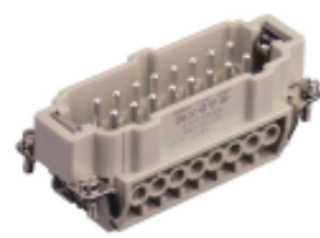
TE Part # T2040162101-000 HE-016-M