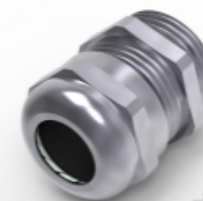
TE Part # T3609320102-000 DLX-32-M