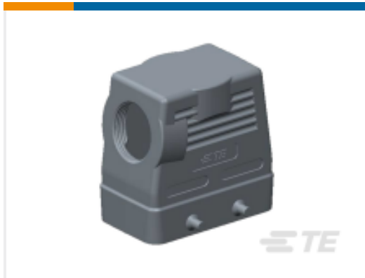
TE Part #T1230160140-001 H16B-TSH-M40