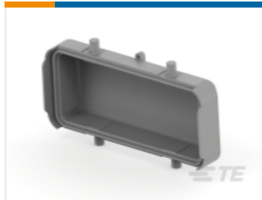
TE Part #T0010162000-025 H16B HSG P PRO COVR,4EAR,GREY