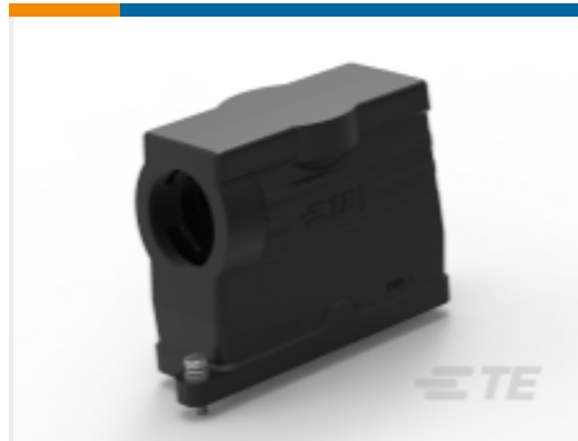
TE Part #T1920240150-002 H24BPR-TGH-XL-M50