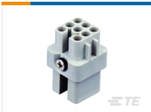
TE Part #T2020082201-000 HD-008-F