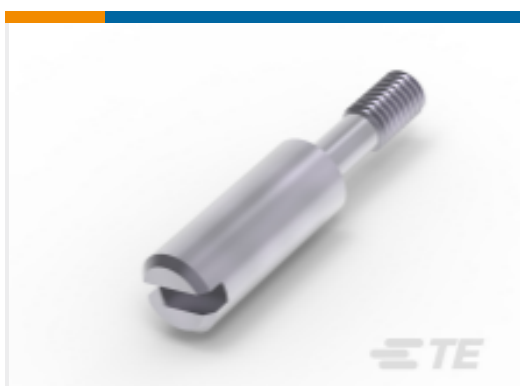
TE Part #T0931003003-000 CODING-PIN-M3