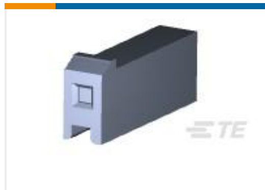
TE Part #640250-1 01P SL156 HSG W/LCK RAMP NATL