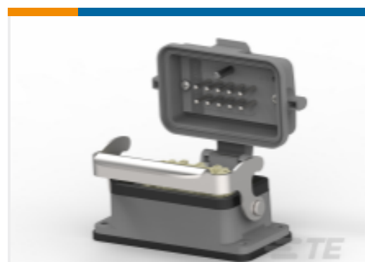
TE Part #T2120100219-000 ZGG-10DSTK,1-7,2-8,3-9,4-6,5-10