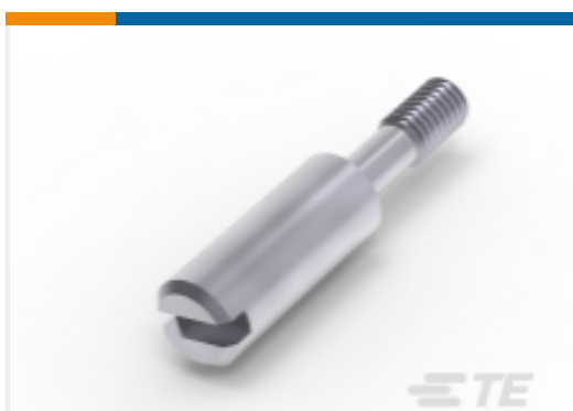
TE Part #T0931003003-000 CODING-PIN-M3