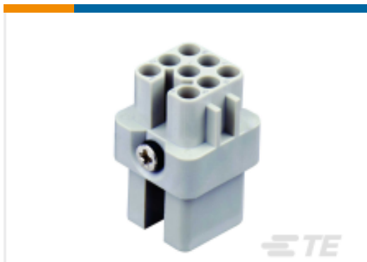
TE Part #T2020082201-000 HD-008-F