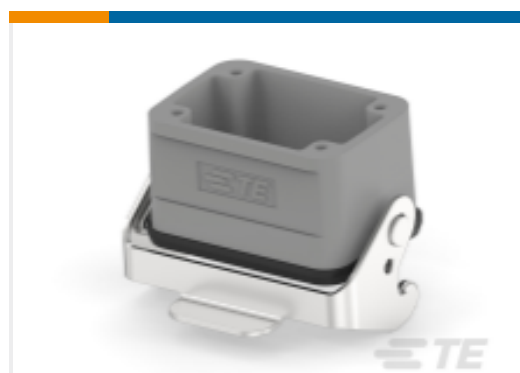
TE Part #T1730060000-000 H6B-TBF-T