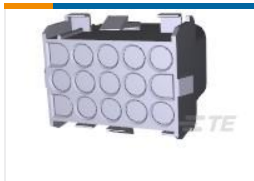
TE Part #1-480711-9 15P UMNL CAP HSG BLK