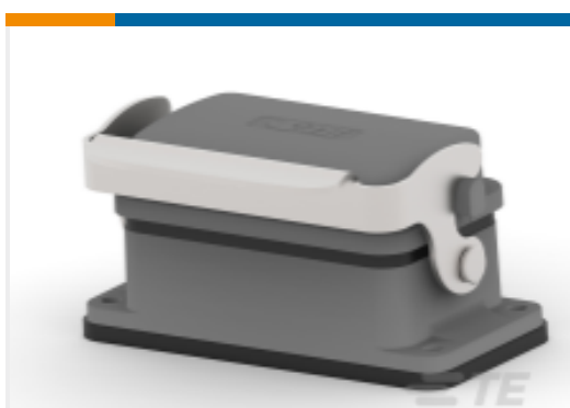
TE Part #T2120100220-000 ZGGP-H10BSK 1-7/2-8/3-9/4-6/5-10