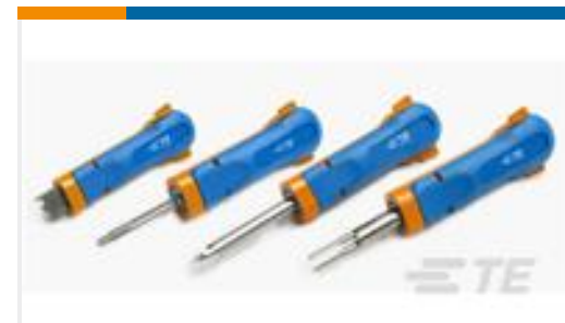
TE Part #539960-1 AUSZ-WKZ,MICRO TIM.