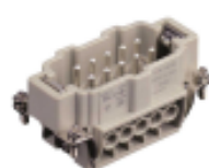
TE Part # T2040102101-000 HE-010-M