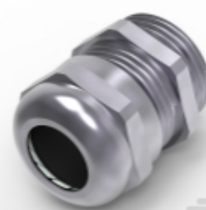
TE Part # T3609320102-000 DLX-32-M