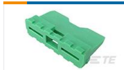
TE Part #W12P WEDGE LOCK, 12P, REC, GRN, DT