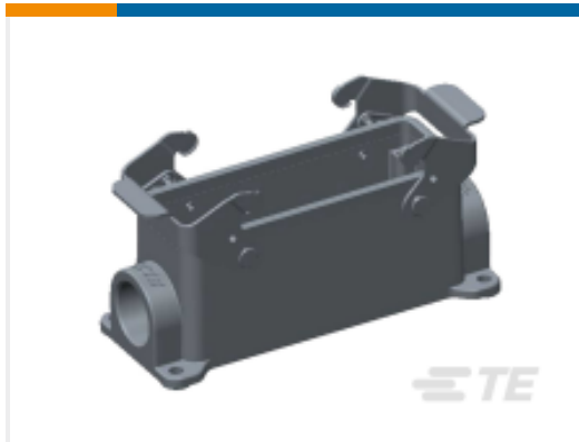
TE Part #T1440242121-000 H24B-SGR-PG21