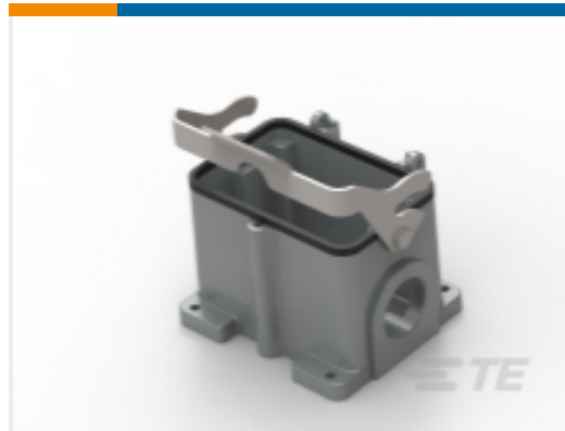
TE Part #T1610482140-000 H48B-SGR-LB-M40