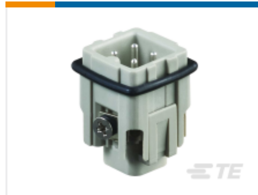
TE Part #T2010032101-000 HA-003-M