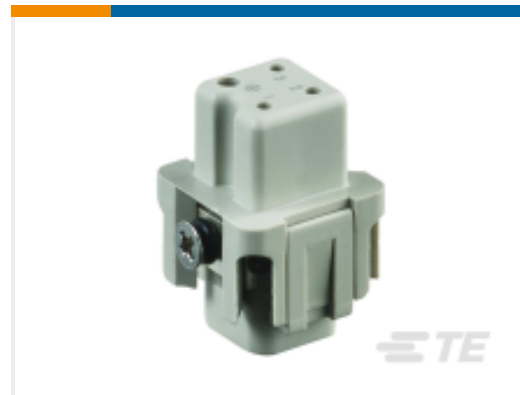
TE Part #T2010032201-000 HA-003-F