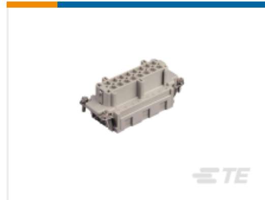
TE Part #T2040163201-000 HE-016-FS