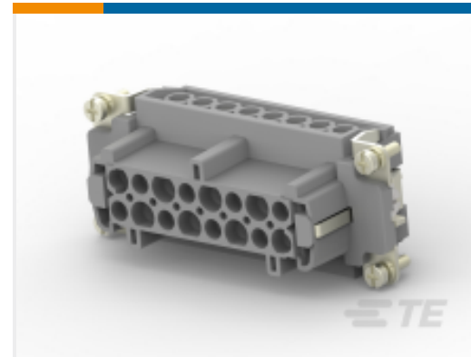
TE Part #T2040162201-000 HE-016-F