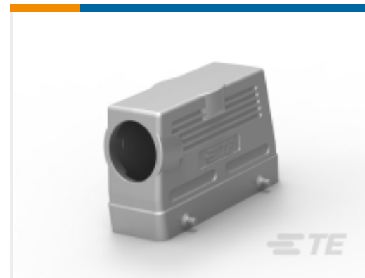
TE Part #T1230240129-000 H24B-TSH-PG29