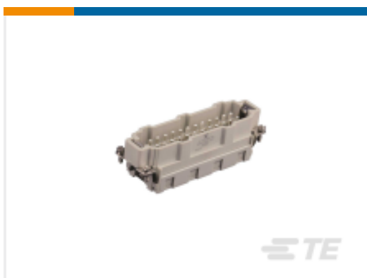
TE Part #T2040243101-000 HE-024-MS