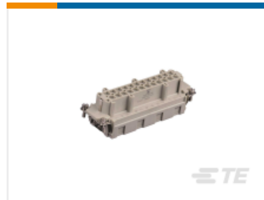
TE Part #T2040243201-000 HE-024-FS