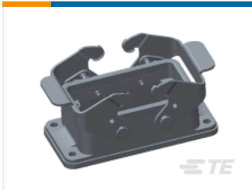
TE Part #T1410102000-000 H10B-AG