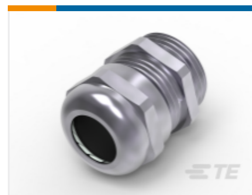
TE Part # T3609250102-000 DLX-25-M