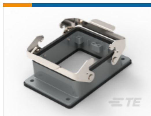
TE Part # T1410322000-000 H32B-AG