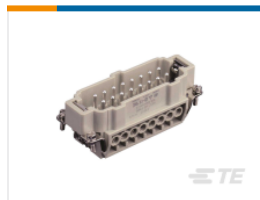
TE Part # T2040322101-000 HE-016-M 17-32