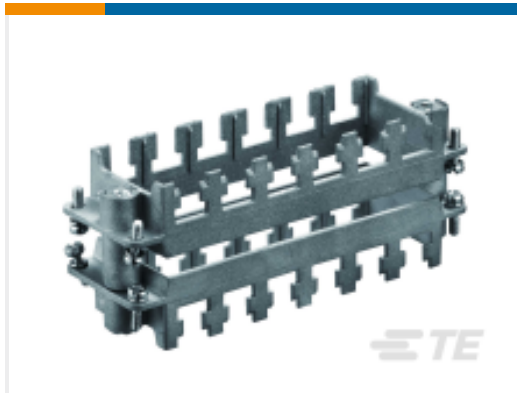
TE Part #T2070244001-000 H24BN-T6