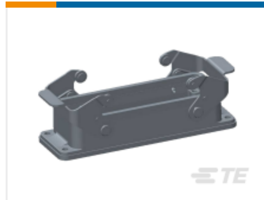
TE Part #T1410241000-000 H24B-AGS