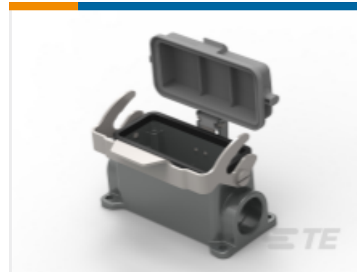
TE Part #T1620163120-000 H16B-SDR-LB-M20