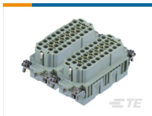
TE Part # T2051283201-000 HEEE-064-F 65-128