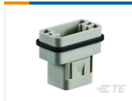
TE Part # T2019092101-000 HQ-008-M