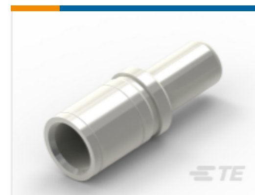
TE Part # T2193501120-000 HCM350-MC-120