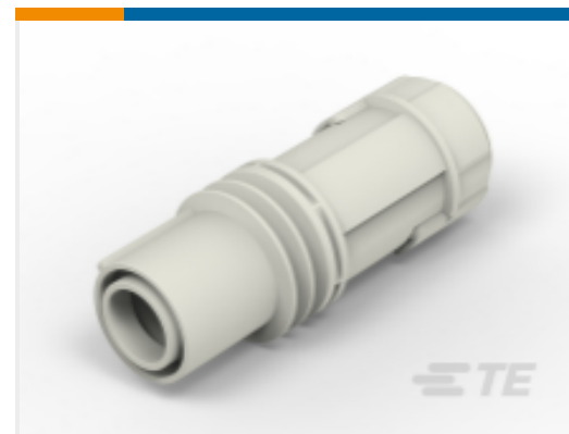
TE Part # T2193503201-000 HCM350-FC