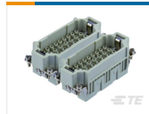
TE Part # T2051283101-000 HEEE-064-M 65-128