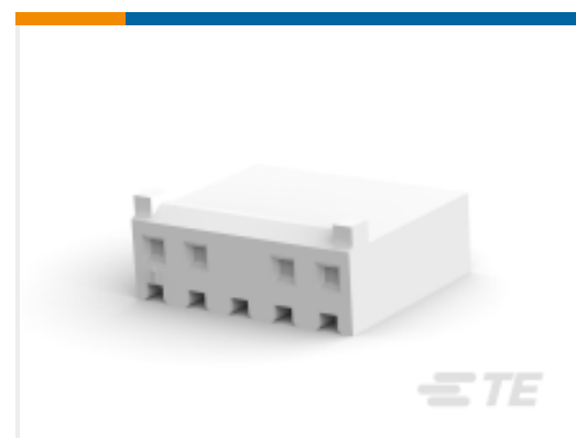
TE Part # 647344-5 05P SL156 HSG W/RP TB BLK #3