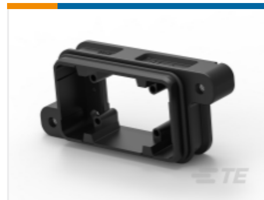
TE Part # T1930060000-009 H6BPR-AG-EMC-C