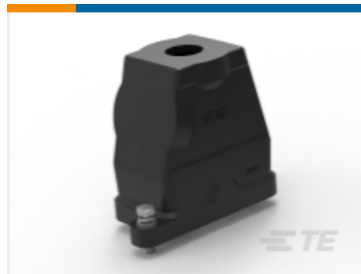
TE Part # T1920060125-009 H6BPR-TGH-M25-EMC-C