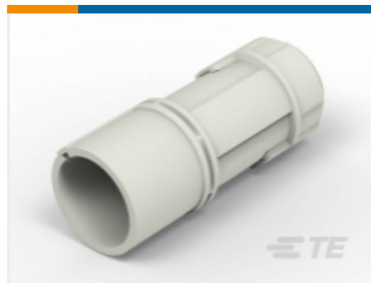
TE Part # T2193503101-000 HCM350-MC