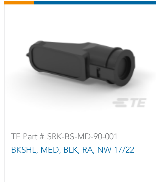
TE Part # SRK-BS-MD-90-001 BKSHL, MED, BLK, RA, NW 17/22