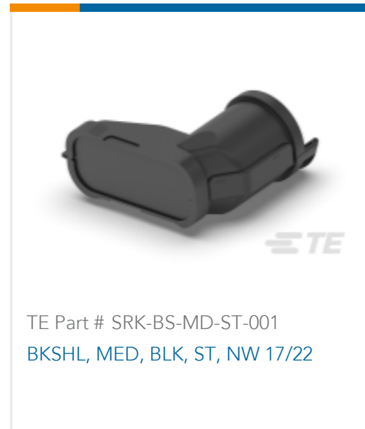
TE Part # SRK-BS-MD-ST-001 BKSHL, MED, BLK, ST, NW 17/22