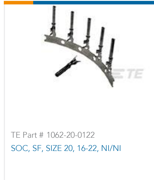
TE Part # 1062-20-0122 SOC, SF, SIZE 20, 16-22, NI/NI