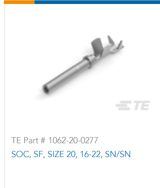
TE Part # 1062-20-0277 SOC, SF, SIZE 20, 16-22, SN/SN