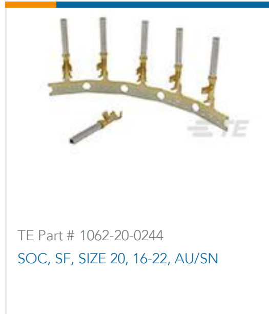
TE Part # 1062-20-0244 SOC, SF, SIZE 20, 16-22, AU/SN