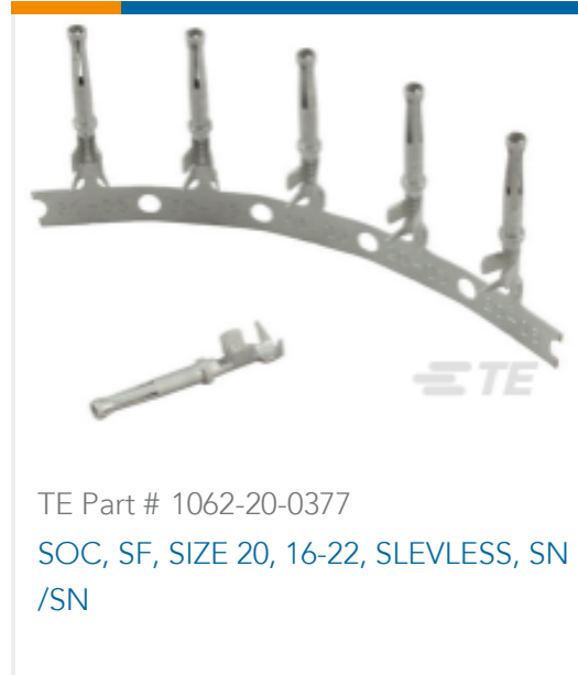
TE Part # 1062-20-0377 SOC, SF, SIZE 20, 16-22, SLEEVLESS, SN /SN