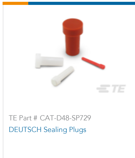
TE Part # CAT-D48-SP729 DEUTSCH Sealing Plugs