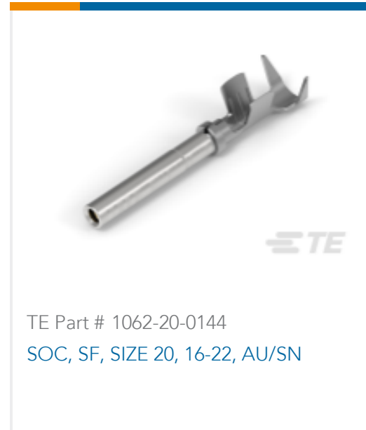
TE Part # 1062-20-0144 SOC, SF, SIZE 20, 16-22, AU/SN