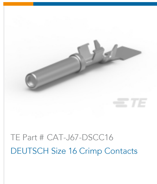
TE Part # CAT-J67-DSCC16 DEUTSCH Size 16 Crimp Contacts