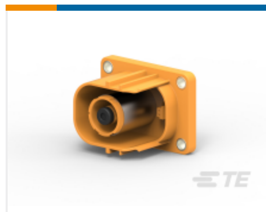
TE Part #2137740-2 HV1100 1POS HEADER 90 DEG ASSY SLD