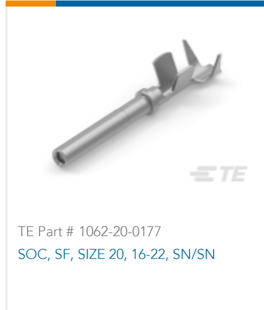
TE Part # 1062-20-0177 SOC, SF, SIZE 20, 16-22, SN/SN