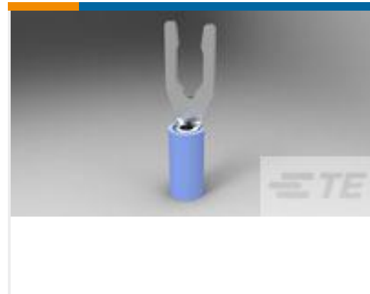
TE Part #52421-1 TERMINAL,PIDG SPR SPD 16-14 8