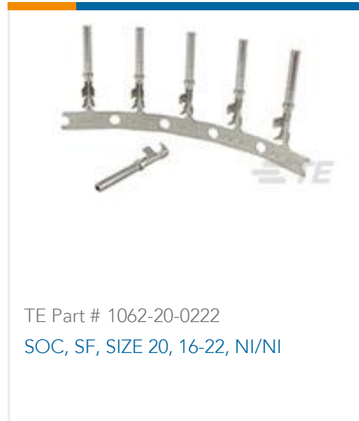
TE Part # 1062-20-0222 SOC, SF, SIZE 20, 16-22, NI/NI