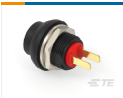
TE Part #1-2329328-1 PB OFF/ON HC BLK M3 TERM. IP68