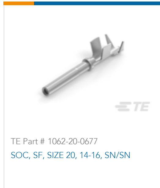
TE Part # 1062-20-0677 SOC, SF, SIZE 20, 14-16, SN/SN