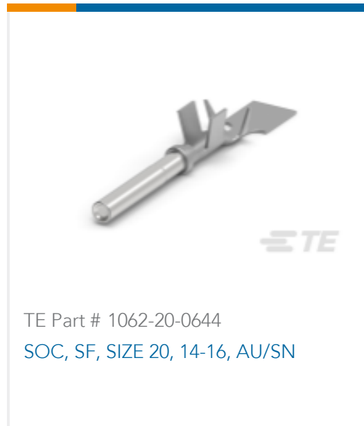
TE Part # 1062-20-0644 SOC, SF, SIZE 20, 14-16, AU/SN