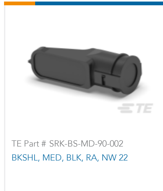
TE Part # SRK-BS-MD-90-002 BKSHL, MED, BLK, RA, NW 22