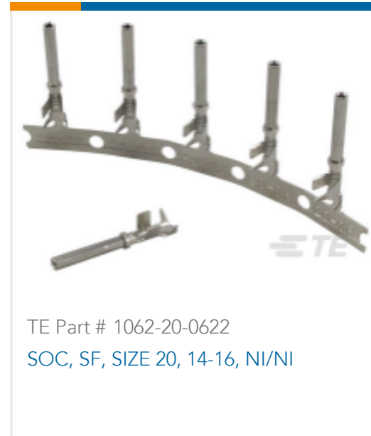
TE Part # 1062-20-0622 SOC, SF, SIZE 20, 14-16, NI/NI