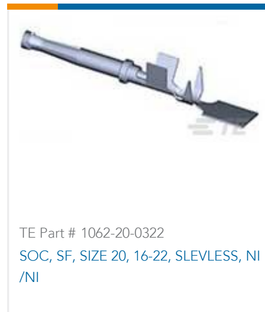
TE Part # 1062-20-0322 SOC, SF, SIZE 20, 16-22, SLEEVLESS, NI /NI