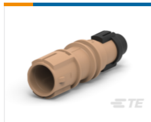
TE Part #DTSK04-1-08PC RECEPTACLE, INLINE, KEY C