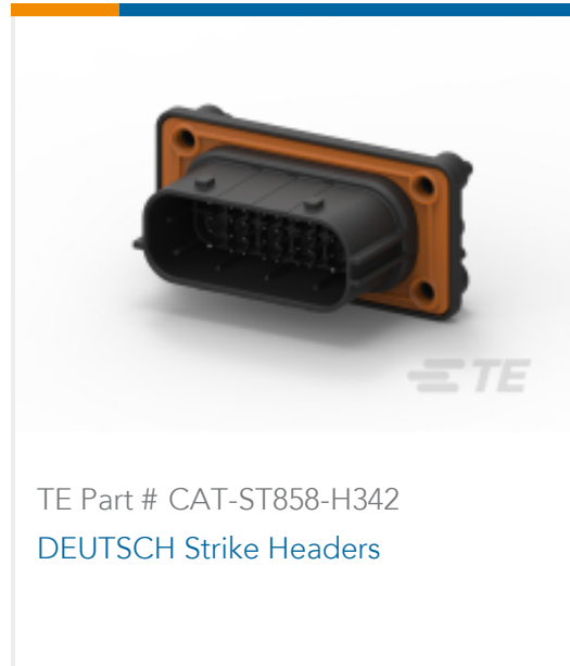
TE Part # CAT-ST858-H342 DEUTSCH Strike Headers