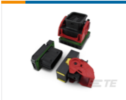
TE Part #SRK06-MDB-32A-001 DEUTSCH Strike Housings