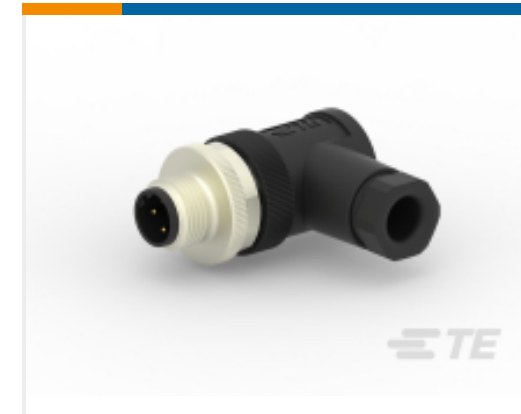
TE Part #T4113401041-000 M12,MALE,RA,B CODE,4P,PG7,GOLD