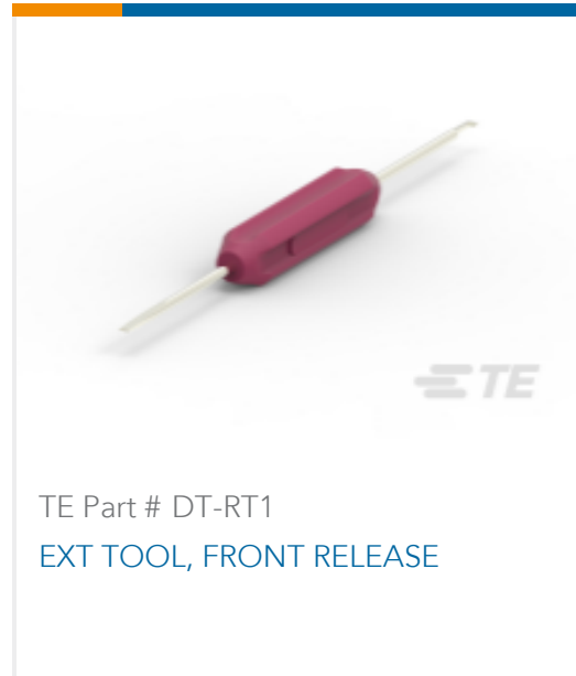
TE Part # DT-RT1 EXT TOOL, FRONT RELEASE