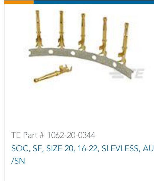
TE Part # 1062-20-0344 SOC, SF, SIZE 20, 16-22, SLEEVLESS, AU /SN