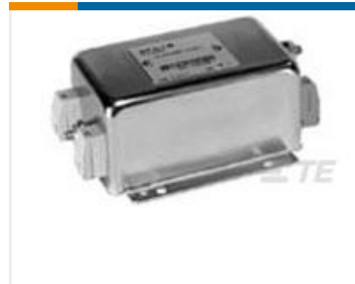
TE Part #6609069-4 25FC10 J0=F7750