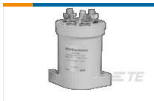
TE Part #5-1618388-8 LEV200A6NAA=RELAY, SPST-NO