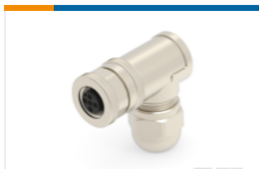
TE Part #T4112012041-000 M12 F, 4P GOLD A_CODE RA SHIELDED PG9