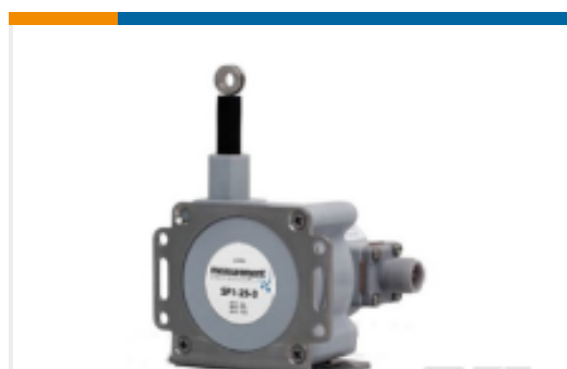
TE Part #SP1-50 STRING POT 50.0 INCH RANGE