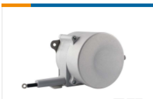
TE Part #SR1E-125 STRING POT, 125 INCH RANGE