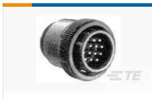
TE Part #206429-1 CPC PLUG ASSY, 11-4, REV SEX