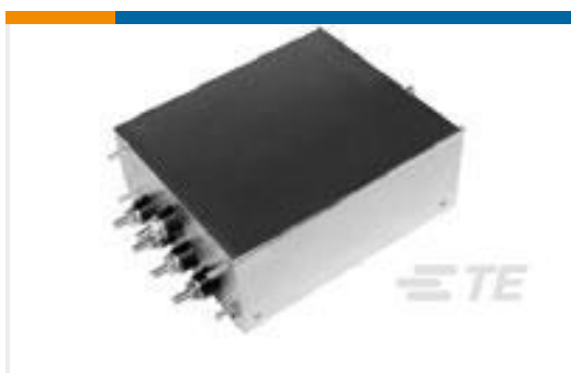
TE Part #6609073-1 20AYT6C J0=F7474