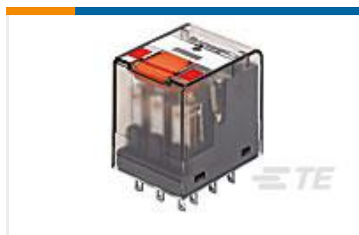
TE Part #8-1419132-9 PT580615