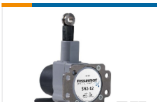
TE Part #SM2-25 STRING POT, 25 INCH RANGE