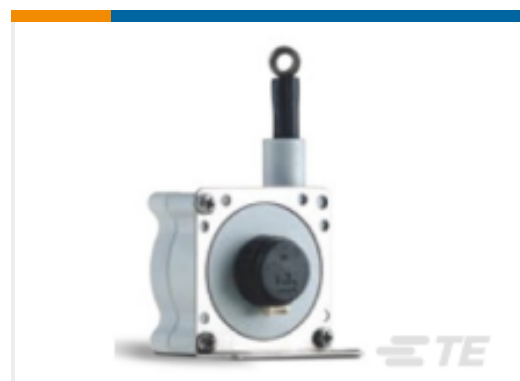
TE Part #SE1-50 STRING ENCODER, 50 INCH RANGE