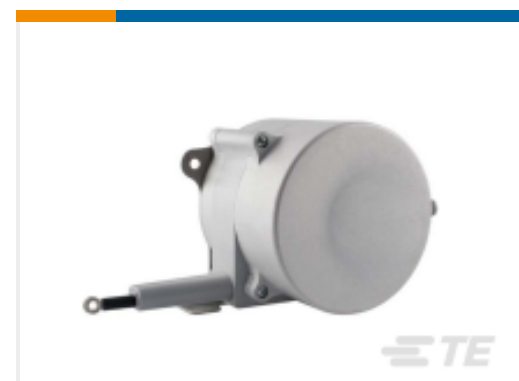
TE Part #SR1M-125 STRING POT, 125 INCH RANGE