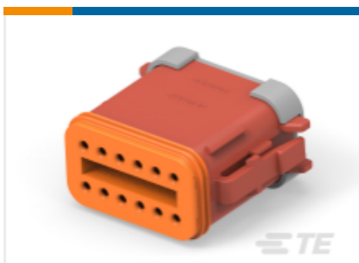
TE Part #DT06-12SD-C017 PLG, 12P, BRN, BLOCKED, D