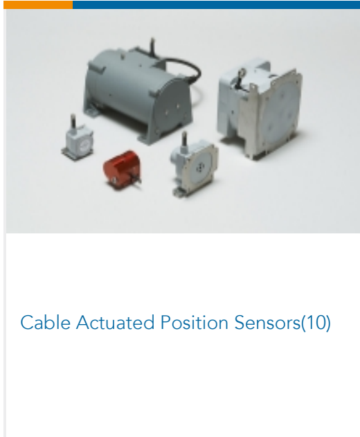
Cable Actuated Position Sensors(10)