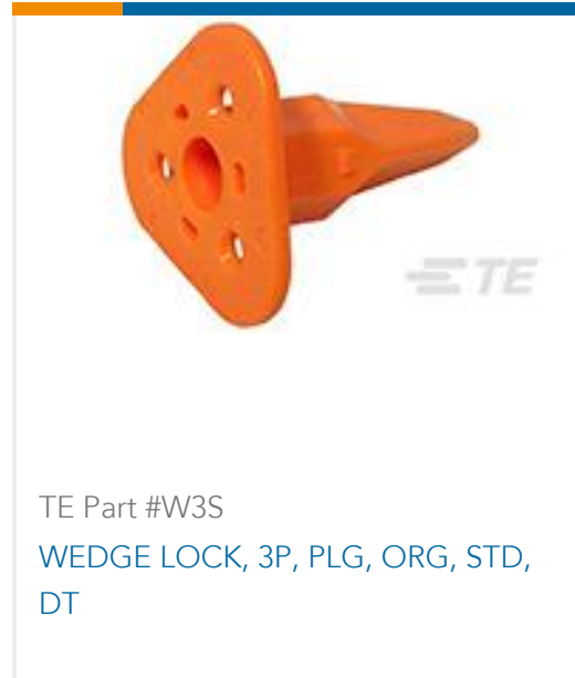
TE Part #W3S WEDGE LOCK, 3P, PLG, ORG, STD, DT