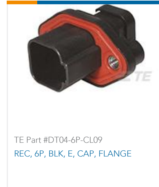
TE Part #DT04-6P-CL09 REC, 6P, BLK, E, CAP, FLANGE