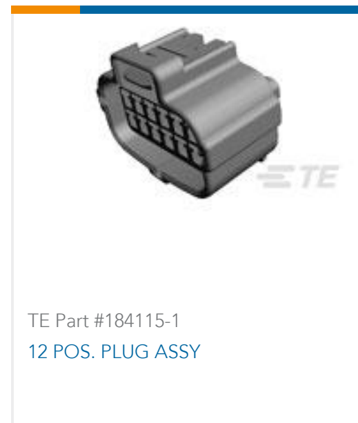
TE Part #184115-1 12 POS. PLUG ASSY