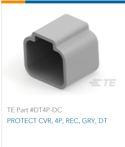
TE Part #DT4P-DC PROTECT CVR, 4P, REC, GRY, DT