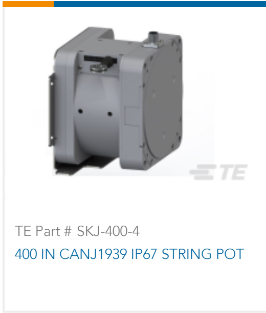
TE Part # SKJ-400-4 400 IN CANJ1939 IP67 STRING POT