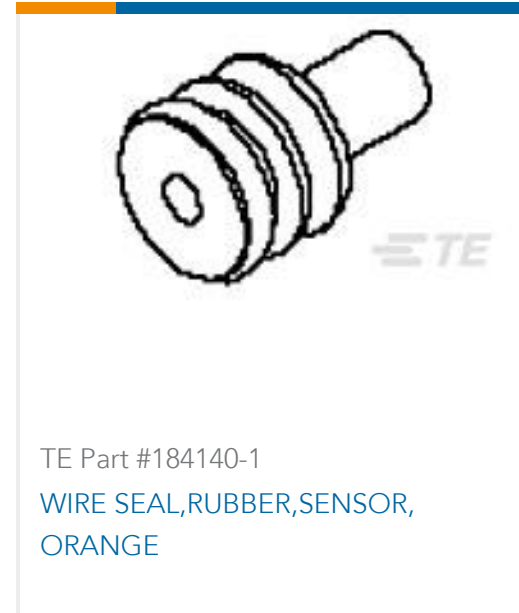
TE Part #184140-1 WIRE SEAL,RUBBER,SENSOR, ORANGE