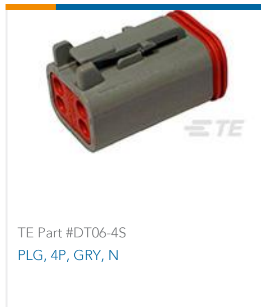
TE Part #DT06-4S PLG, 4P, GRY, N