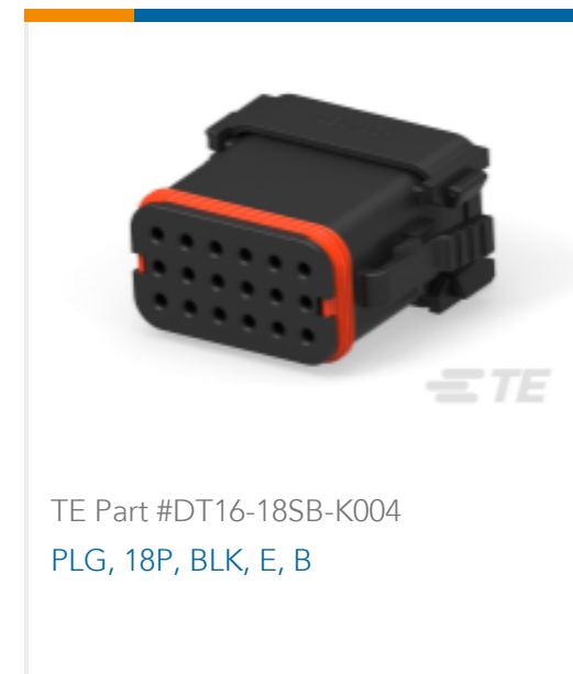
TE Part #DT16-18SB-K004 PLG, 18P, BLK, E, B