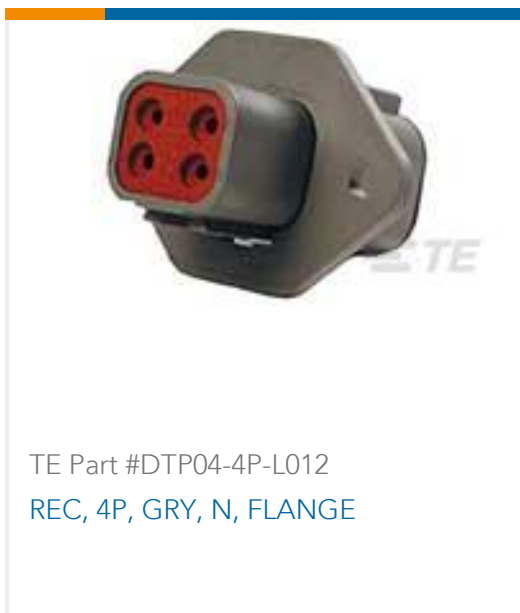
TE Part #DTP04-4P-L012 REC, 4P, GRY, N, FLANGE