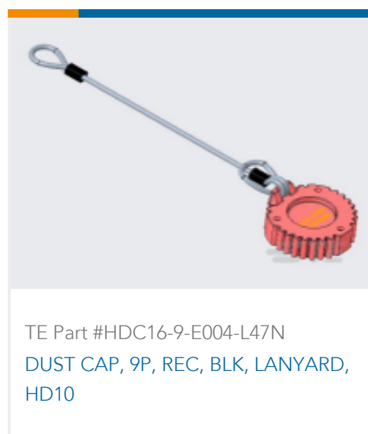
TE Part #HDC16-9-E004-L47N DUST CAP, 9P, REC, BLK, LANYARD, HD10