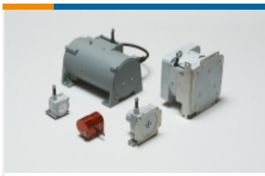
Cable Actuated Position Sensors(10)