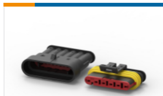
TE Part #282080-1 AMP SUPERSEAL 1.5MM, CONNECTOR HOUSING