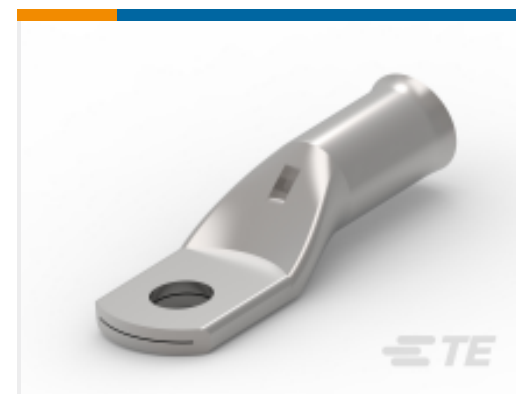
TE Part #710978-1 XCT 4-5