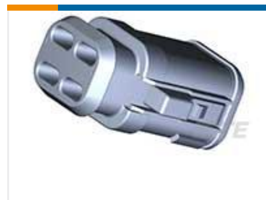
TE Part #DT06-08SA-CE13 PLG, 8P, GRY, E, SEAL RET, XCAP, A