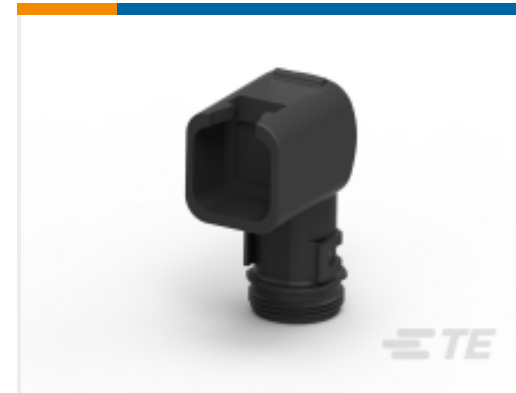
TE Part #1011-240-0605 BKSHL, 6P, BLK, PLG, RA, NW8.5/10/13