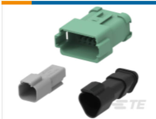
TE Part #DT04-12PC DEUTSCH DT Receptacle Connectors