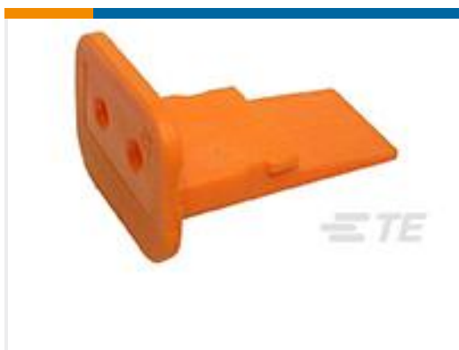
TE Part #W2S WEDGE LOCK, 2P, PLG, ORG, STD, DT