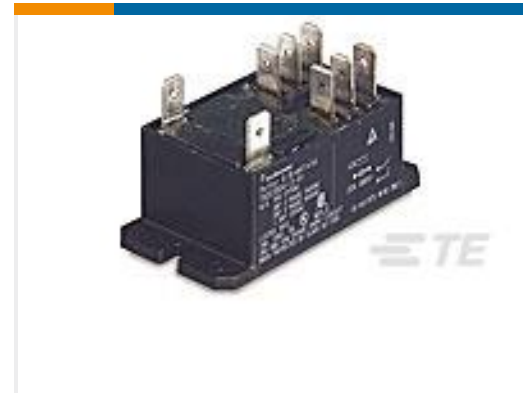
TE Part #1-1393212-3 T92S7D22-110