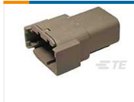
TE Part #DTM04-08PA REC, 8P, GRY, N, A