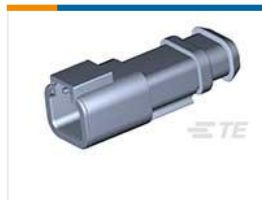
TE Part #DTP04-2P-EE01 REC, 2P, BLK, N, XCAP