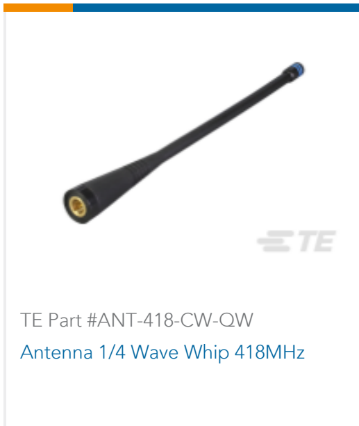
TE Part # ANT-418-CW-QW Antenna 1/4 Wave Whip 418MHz