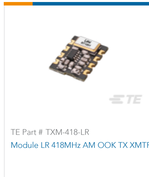
TE Part # TXM-418-LR Module LR 418MHz AM OOK TX XMTR