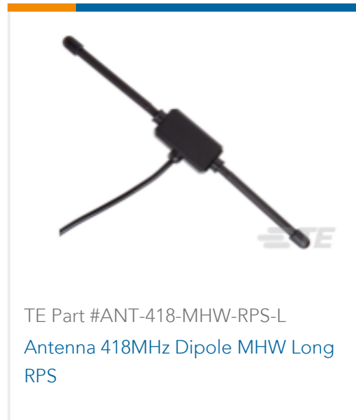
TE Part # ANT-418-MHW-RPS-L Antenna 418MHz Dipole MHW Long RPS