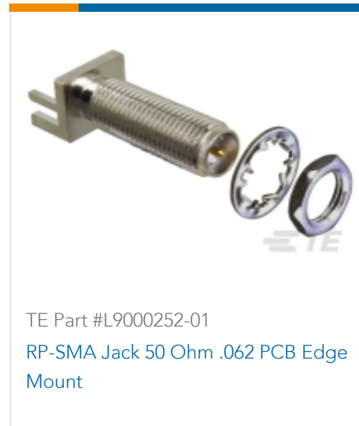
TE Part # L9000252-01 RP-SMA Jack 50 Ohm .062 PCB Edge Mount