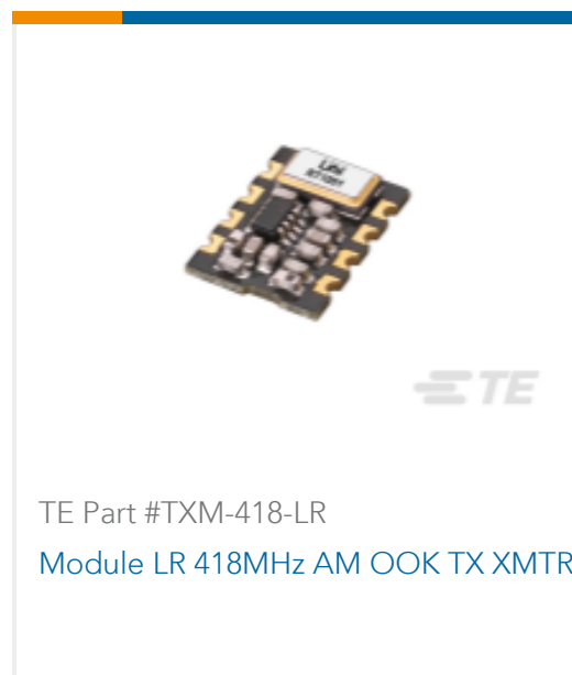
TE Part # TXM-418-LR Module LR 418MHz AM OOK TX XMTR