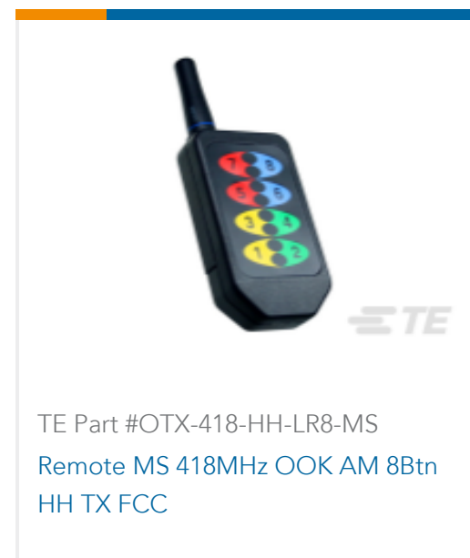
TE Part # OTX-418-HH-LR8-MS Remote MS 418MHz OOK AM 8Btn HH TX FCC