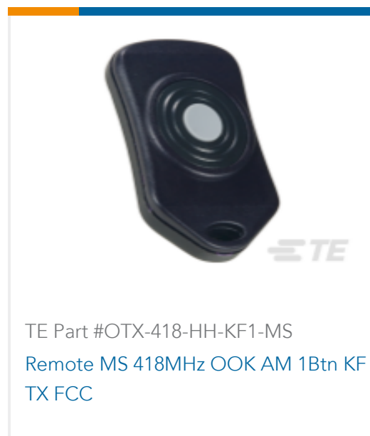
TE Part # OTX-418-HH-KF1-MS Remote MS 418MHz OOK AM 1Btn KF TX FCC