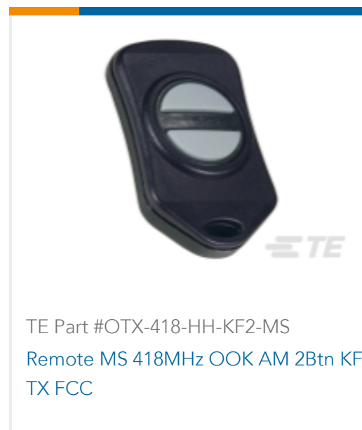
TE Part # OTX-418-HH-KF2-MS Remote MS 418MHz OOK AM 2Btn KF TX FCC