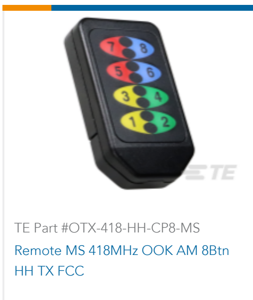
TE Part # OTX-418-HH-CP8-MS Remote MS 418MHz OOK AM 8Btn HH TX FCC