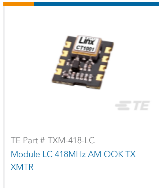
TE Part # TXM-418-LC Module LC 418MHz AM OOK TX XMTR