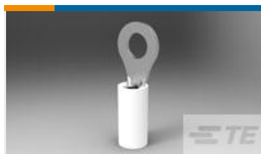
TE Part #152873 14-12 PIDG NYLON RT NO 8 WHITE