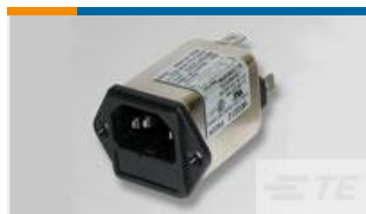
TE Part #3-1609115-4 10EGG1-1=F8227