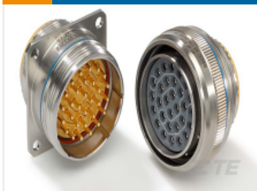
TE Part #ZPF000000000007337 983-0S 10-06 PN