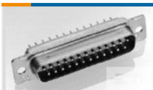
TE Part #205167-1 RECEPT ASSY,37 POSN,AMPLIMITE