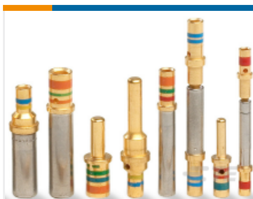
TE Part #2841-5-9000 CONT PIN