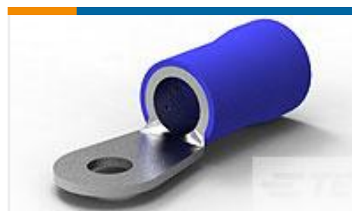
TE Part #52045-1 TERMINAL R PG 1/0 5/16