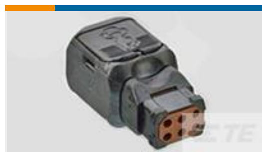
TE Part #D369-R66-NS0 369 6 WAY REC, NO CONTACTS, SKT