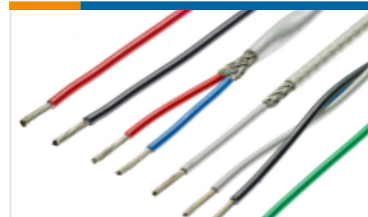
TE Part #318107-006 55A8081-18-9