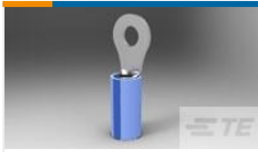
TE Part #51864-6 TERMINAL,PIDG R IR 16 6