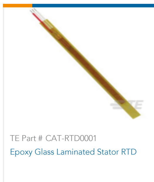
TE Part # CAT-RTD0001 Epoxy Glass Laminated Stator RTD