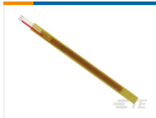
TE Part #R-8203 RTD,STRR,C10,427,.5%,.030T,H