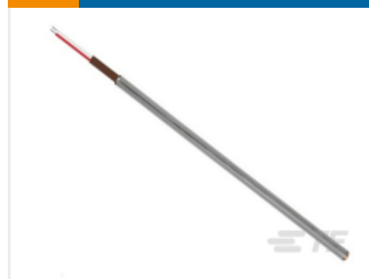
TE Part #R-10318-69 TC,BRG,IS,T,STD,U,.188D