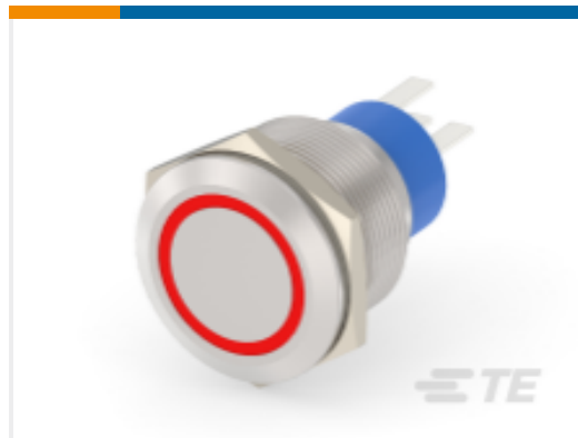
TE Part #2-2213772-5 AV22 SPL 5A MOVE RING LED RED 12V