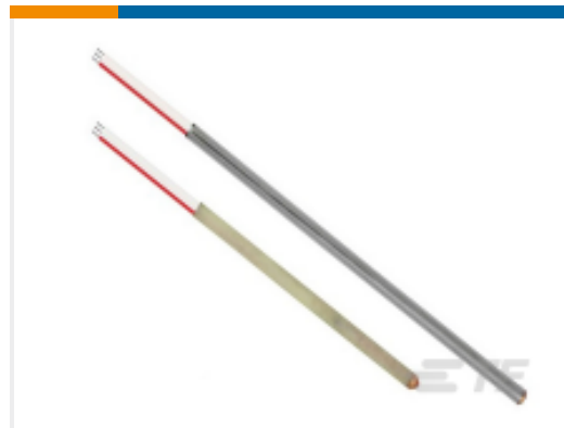
TE Part #R-8580-362 RTD,BRG,SS,P100,385,.12%,.250D