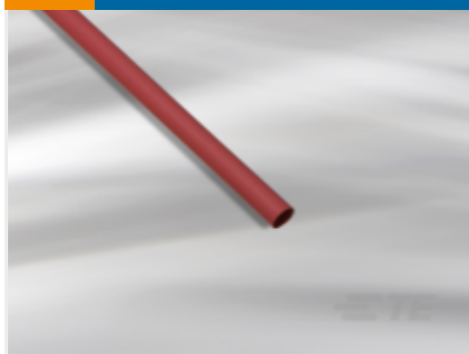
TE Part #NB07086001 BATTU-12.7/6.1-A1-2-32MM