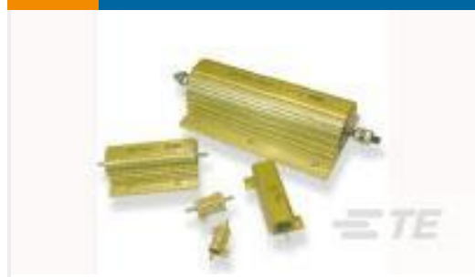
TE Part #2-1676625-4 HSA25 34R 5%