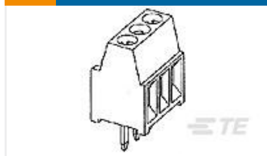
TE Part #1-282834-1 TERMI-BLOK PCB MOUNT, 90 11P.