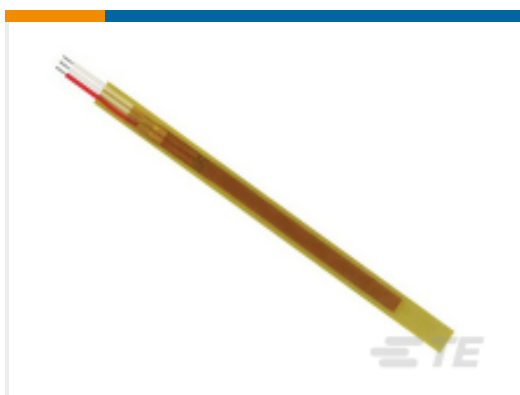
TE Part #R-8204 RTD,STRR,P100,385,.5%,.030T,H