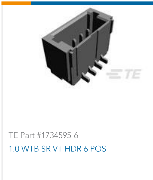
TE Part #1734595-6 1.0 WTB SR VT HDR 6 POS