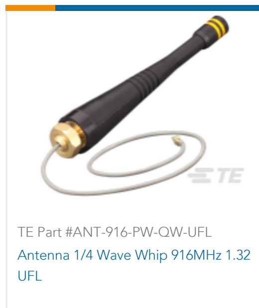
TE Part #ANT-916-PW-QW-UFL Antenna 1/4 Wave Whip 916MHz 1.32 UFL