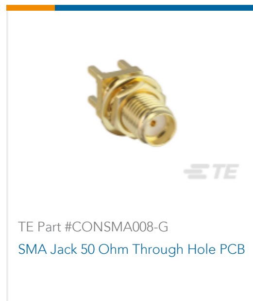
TE Part #CONSMSA008-G SMA Jack 50 Ohm Through Hole PCB