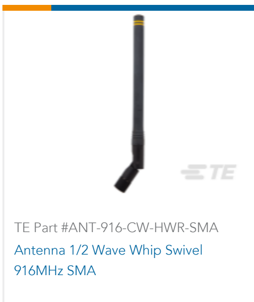
TE Part #ANT-916-CW-HWR-SMA Antenna 1/2 Wave Whip Swivel 916MHz SMA