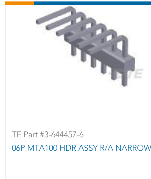
TE Part #3-644457-6 06P MTA100 HDR ASSY R/A NARROW