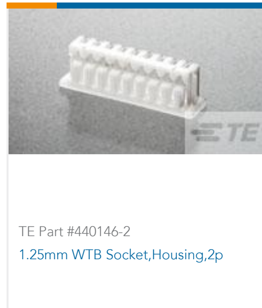
TE Part #440146-2 1.25mm WTB Socket,Housing,2p