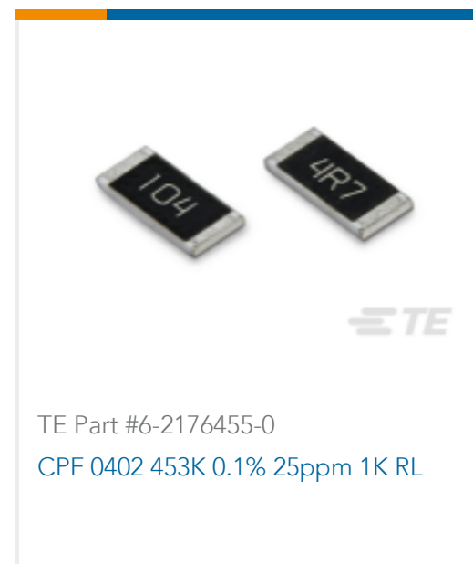
TE Part #6-2176455-0 CPF 0402 453K 0.1% 25ppm 1K RL