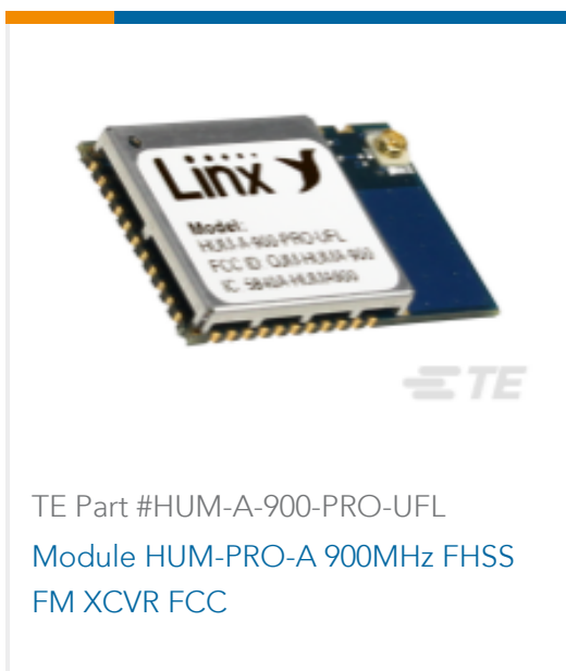
TE Part #HUM-A-900-PRO-UFL Module HUM-PRO-A 900MHz FHSS FM XCVR FCC