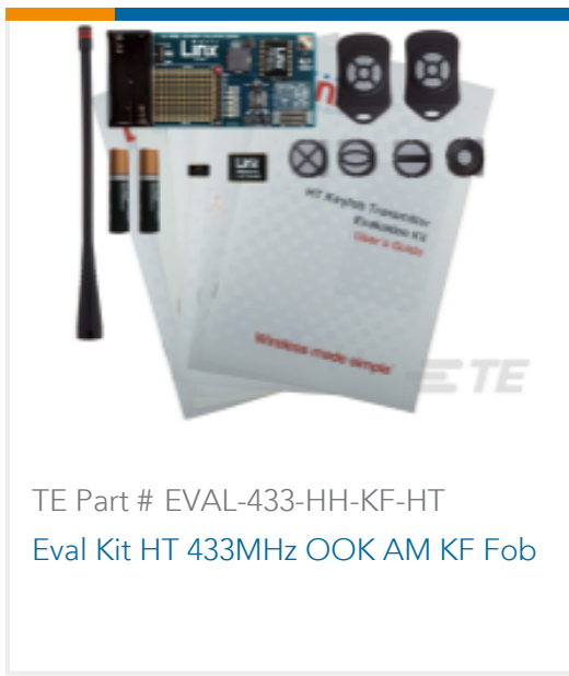
TE Part # EVAL-433-HH-KF-HT Eval Kit HT 433MHz OOK AM KF Fob