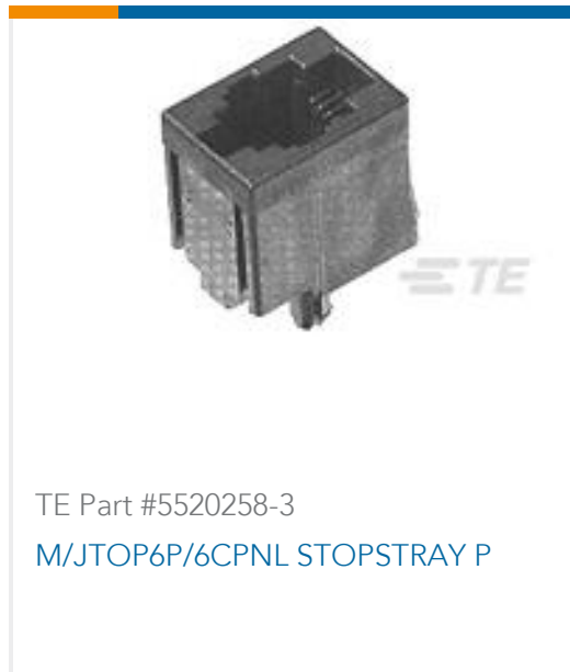
TE Part #5520258-3 M/JTOP6P/6CPNL STOPSTRAY P