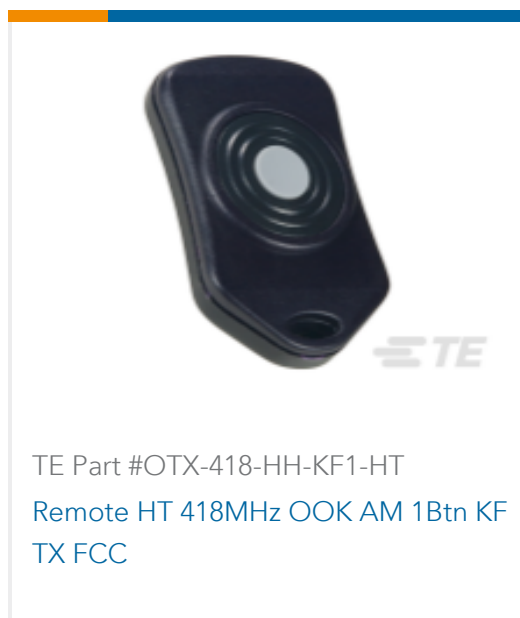
TE Part #OTX-418-HH-KF1-HT Remote HT 418MHz OOK AM 1Btn KF TX FCC