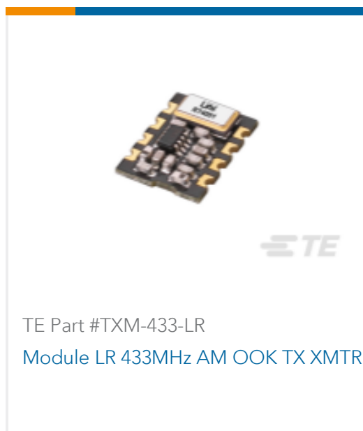
TE Part #TXM-433-LR Module LR 433MHz AM OOK TX XMTR