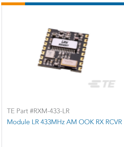
TE Part #RXM-433-LR Module LR 433MHz AM OOK RX RCVR