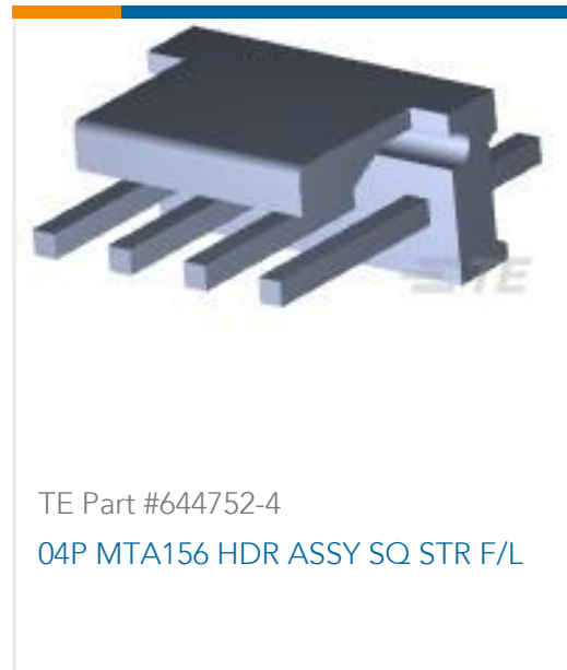
TE Part #644752-4 04P MTA156 HDR ASSY SQ STR F/L