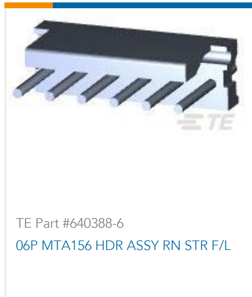
TE Part #640388-6 06P MTA156 HDR ASSY RN STR F/L