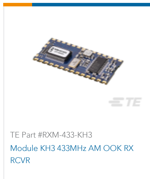
TE Part #RXM-433-KH3 Module KH3 433MHz AM OOK RX RCVR