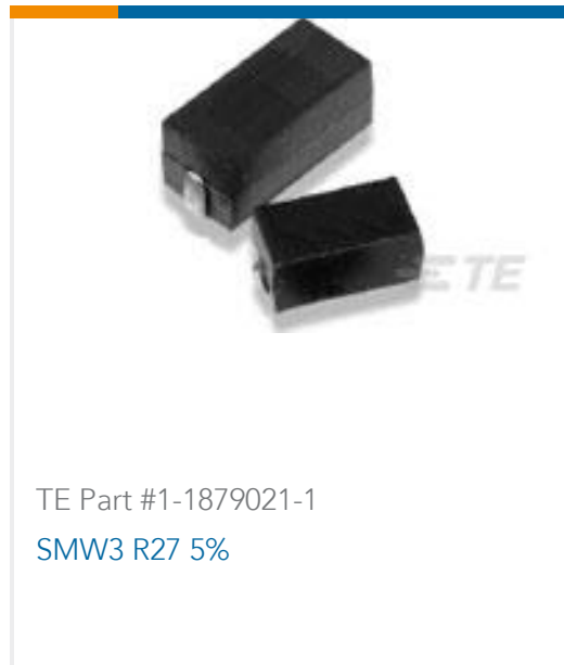
TE Part #1-1879021-1 SMW3 R27 5%