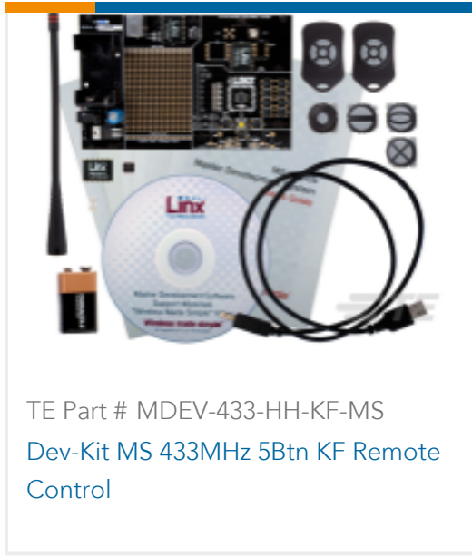
TE Part # MDEV-433-HH-KF-MS Dev-Kit MS 433MHz 5Btn KF Remote Control