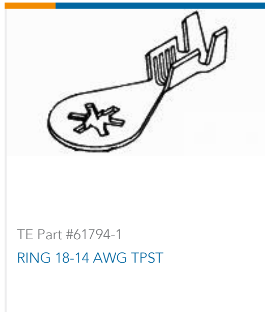
TE Part #61794-1 RING 18-14 AWG TPST