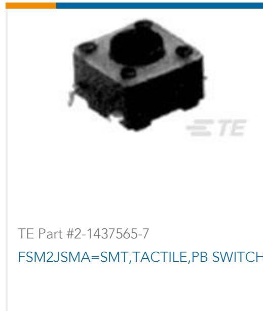
TE Part #2-1437565-7 FSM2JSMA=SMT,TACTILE,PB SWITCH