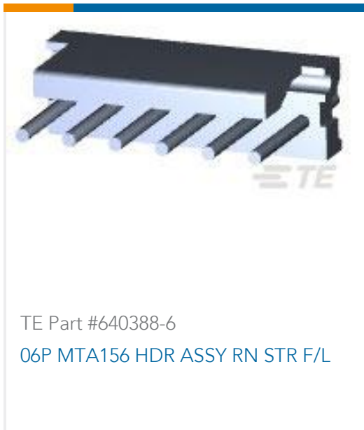
TE Part #640388-6 06P MTA156 HDR ASSY RN STR F/L