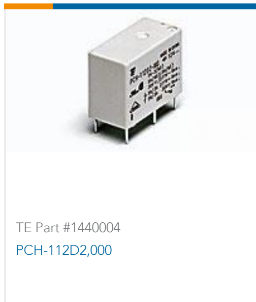
TE Part #1440004 PCH-112D2,000