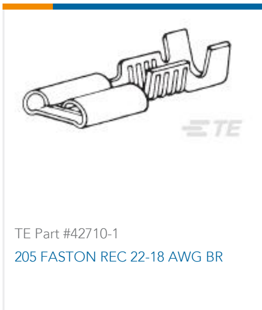
TE Part #42710-1 205 FASTON REC 22-18 AWG BR