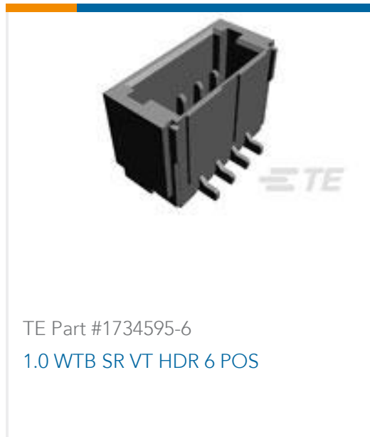
TE Part #1734595-6 1.0 WTB SR VT HDR 6 POS