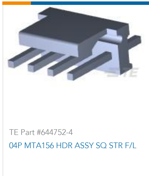
TE Part #644752-4 04P MTA156 HDR ASSY SQ STR F/L