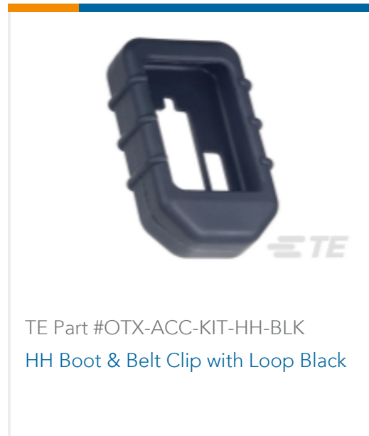
TE Part #OTX-ACC-KIT-HH-BLK HH Boot & Belt Clip with Loop Black