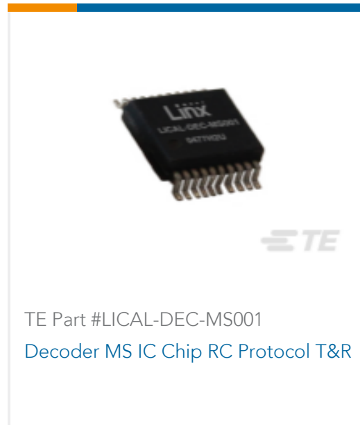
TE Part #LICAL-DEC-MS001 Decoder MS IC Chip RC Protocol T&R