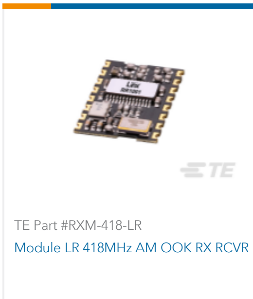
TE Part #RXM-418-LR Module LR 418MHz AM OOK RX RCVR