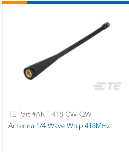
TE Part #ANT-418-CW-QW Antenna 1/4 Wave Whip 418MHz