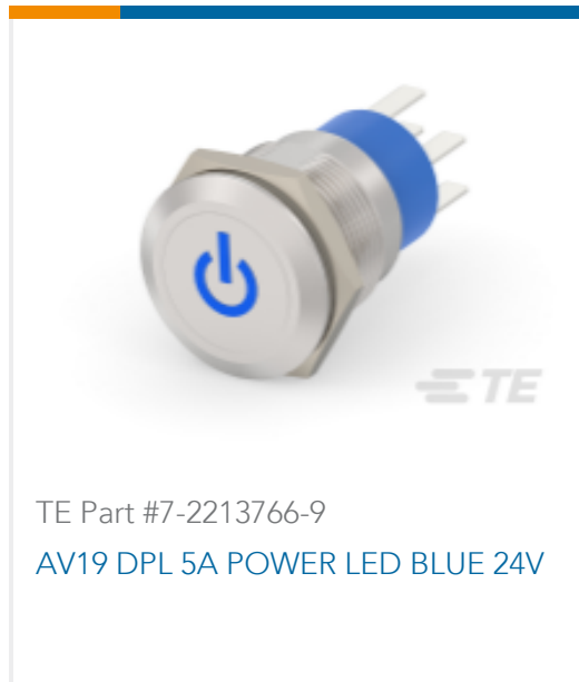
TE Part #7-2213766-9 AV19 DPL 5A POWER LED BLUE 24V