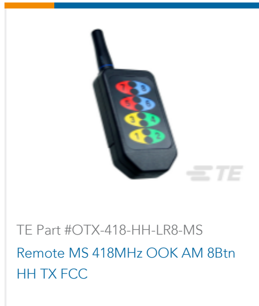
TE Part #OTX-418-HH-LR8-MS Remote MS 418MHz OOK AM 8Btn HH TX FCC