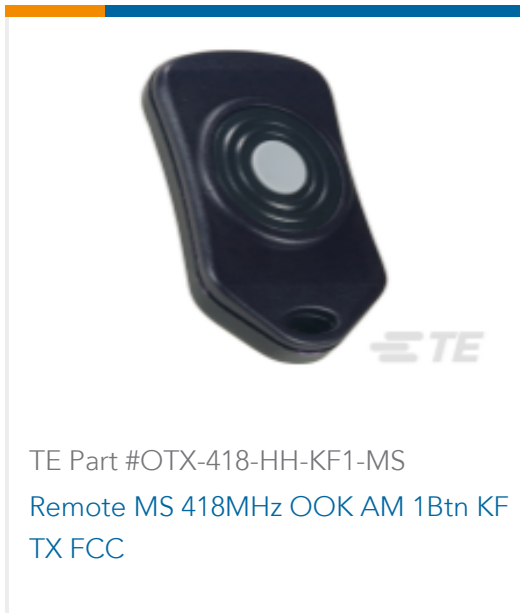
TE Part #OTX-418-HH-KF1-MS Remote MS 418MHz OOK AM 1Btn KF TX FCC