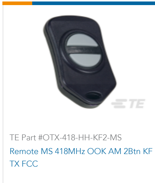
TE Part #OTX-418-HH-KF2-MS Remote MS 418MHz OOK AM 2Btn KF TX FCC