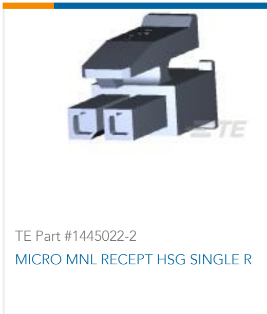
TE Part #1445022-2 MICRO MNL RECEPT HSG SINGLE R