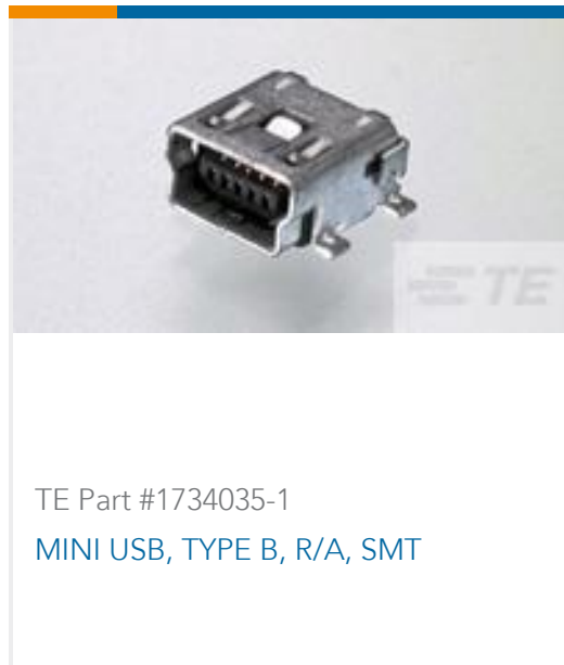
TE Part #1734035-1 MINI USB, TYPE B, R/A, SMT