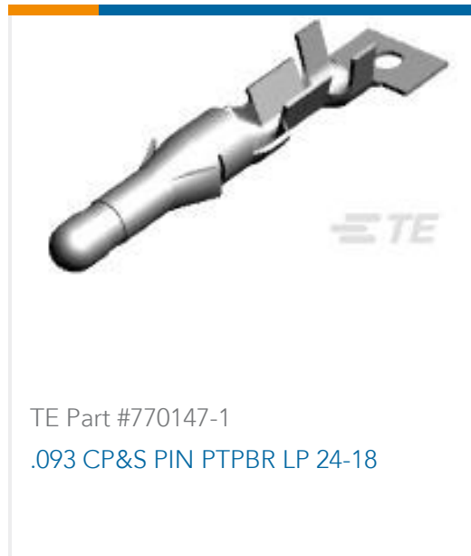
TE Part #770147-1 .093 CP&S PIN PTPBR LP 24-18