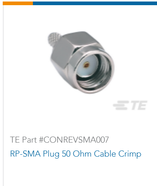
TE Part #CONREV SMA007 RP-SMA Plug 50 Ohm Cable Crimp