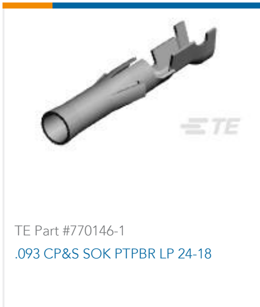
TE Part #770146-1 .093 CP&S SOK PTPBR LP 24-18