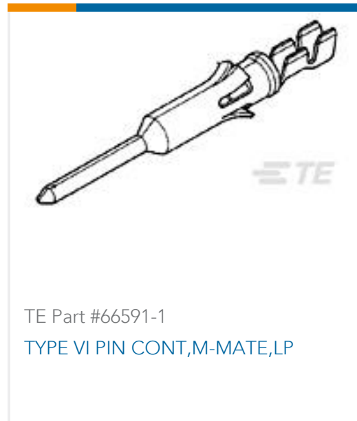
TE Part #66591-1 TYPE VI PIN CONT, M-MATE, LP