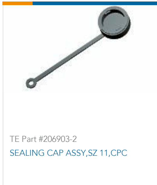
TE Part #206903-2 SEALING CAP ASSY, SZ 11, CPC