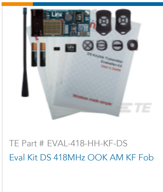
TE Part # EVAL-418-HH-KF-DS Eval Kit DS 418MHz OOK AM KF Fob