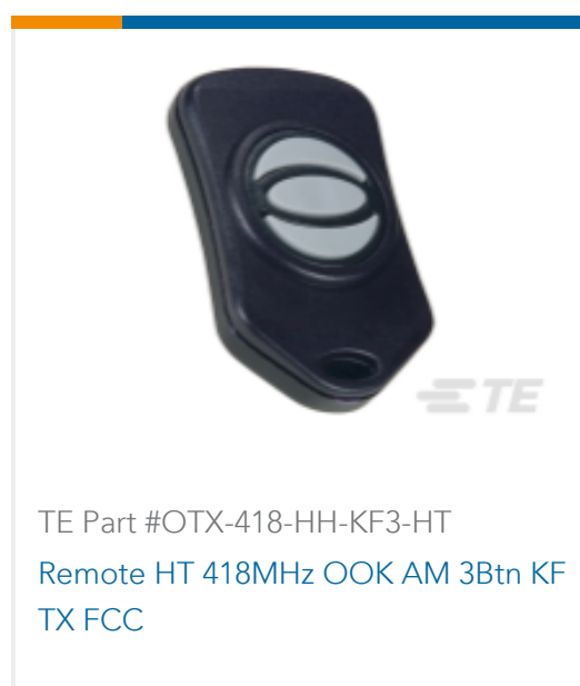
TE Part #OTX-418-HH-KF3-HT Remote HT 418MHz OOK AM 3Btn KF TX FCC