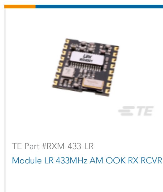
TE Part #RXM-433-LR Module LR 433MHz AM OOK RX RCVR