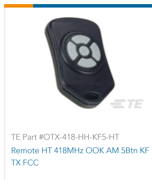
TE Part #OTX-418-HH-KF5-HT Remote HT 418MHz OOK AM 5Btn KF TX FCC