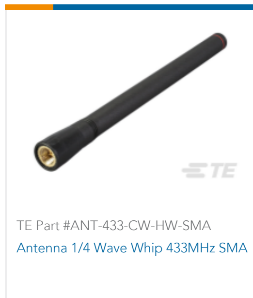
TE Part #ANT-433-CW-HW-SMA Antenna 1/4 Wave Whip 433MHz SMA