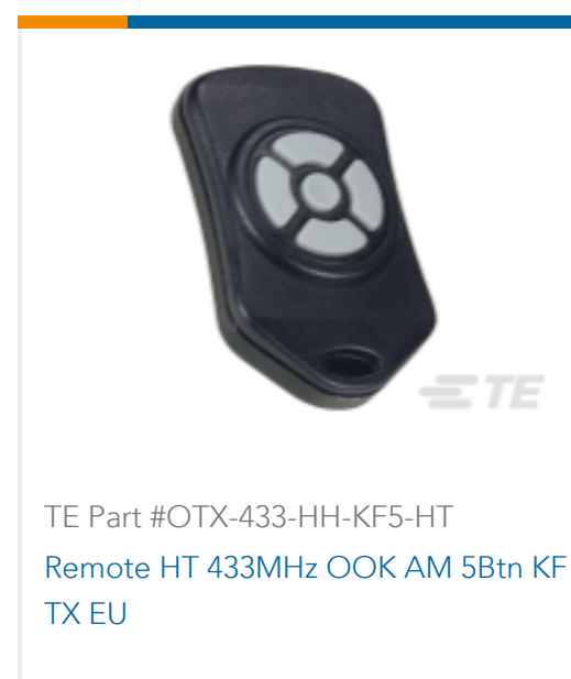
TE Part #OTX-433-HH-KF5-HT Remote HT 433MHz OOK AM 5Btn KF TX EU