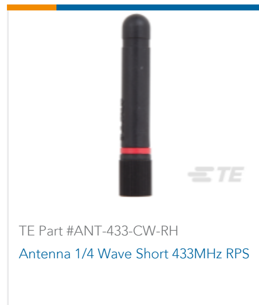
TE Part #ANT-433-CW-RH Antenna 1/4 Wave Short 433MHz RPS