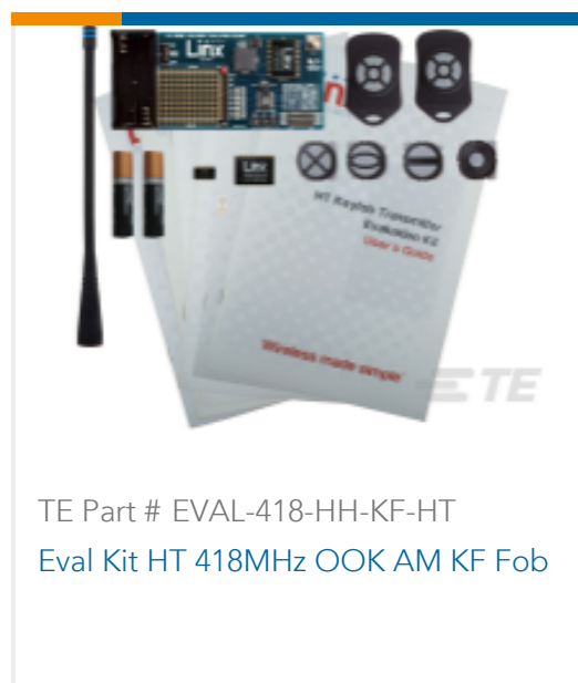
TE Part # EVAL-418-HH-KF-HT Eval Kit HT 418MHz OOK AM KF Fob