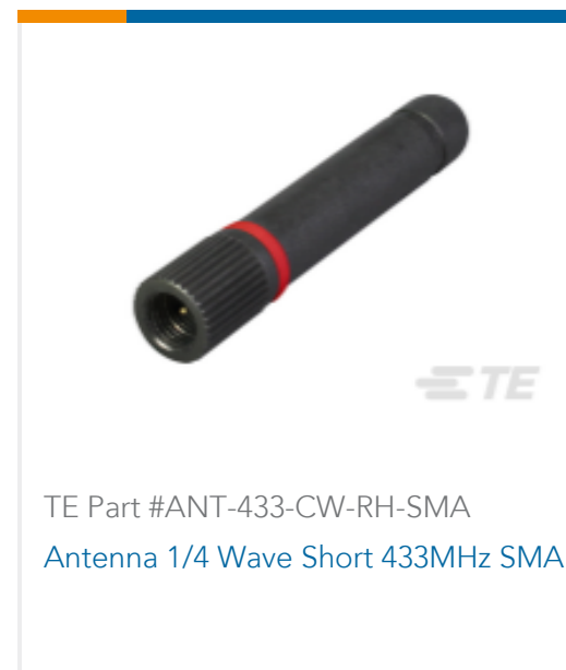
TE Part #ANT-433-CW-RH-SMA Antenna 1/4 Wave Short 433MHz SMA