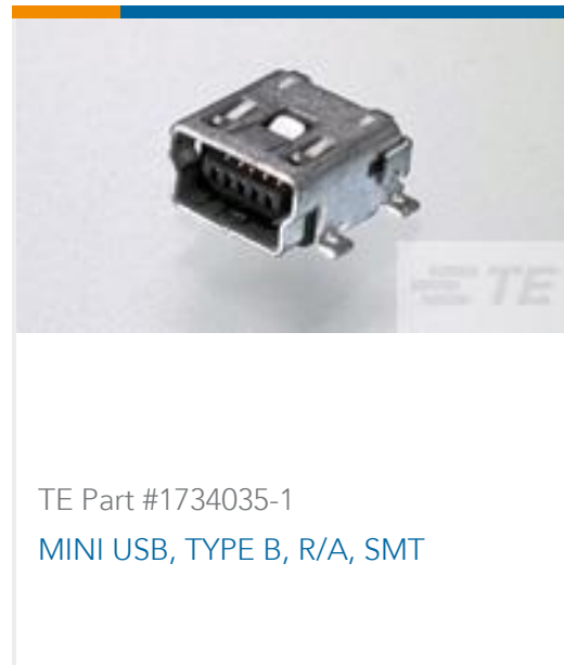
TE Part #1734035-1 MINI USB, TYPE B, R/A, SMT