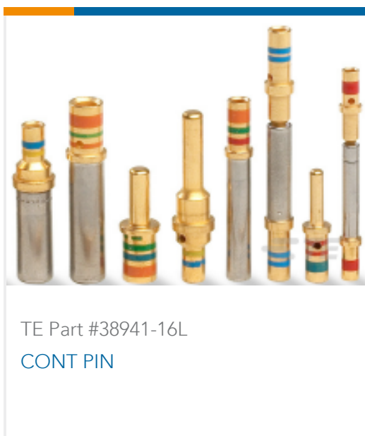
TE Part #38941-16L CONT PIN