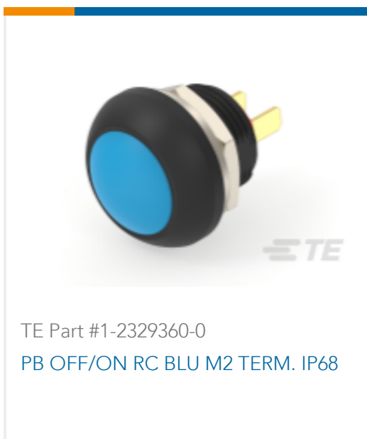
TE Part #1-2329360-0 PB OFF/ON RC BLU M2 TERM. IP68