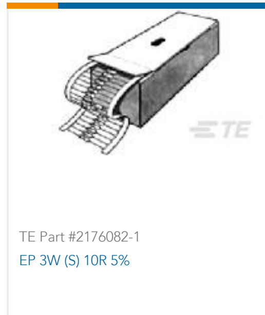
TE Part #2176082-1 EP 3W (S) 10R 5%