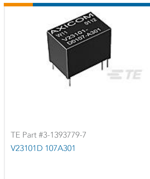
TE Part #3-1393779-7 V23101D 107A301