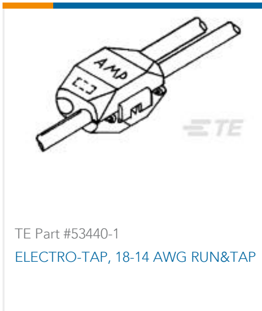
TE Part #53440-1 ELECTRO-TAP, 18-14 AWG RUN&TAP