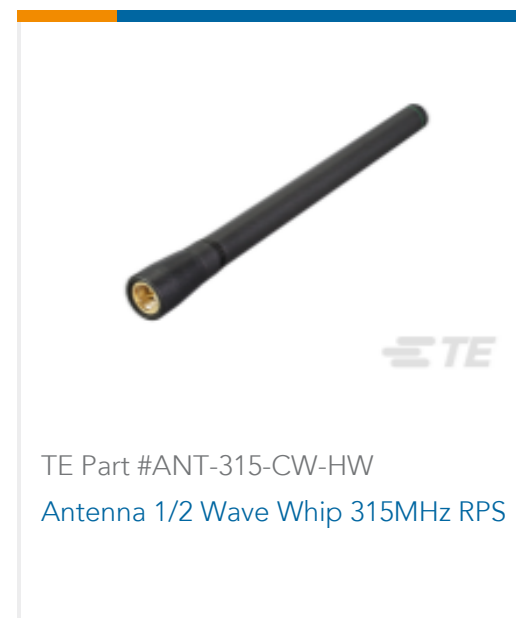
TE Part #ANT-315-CW-HW Antenna 1/2 Wave Whip 315MHz RPS