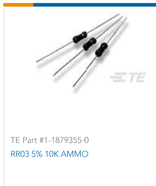
TE Part #1-1879355-0 RR03 5% 10K AMMO