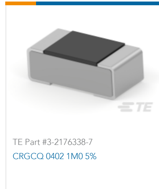
TE Part #3-2176338-7 CRGCO 0402 1M0 5%