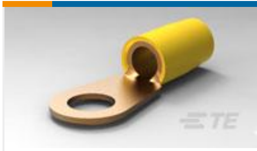
TE Part #324052 TERMINAL,T-N R 4 3/8