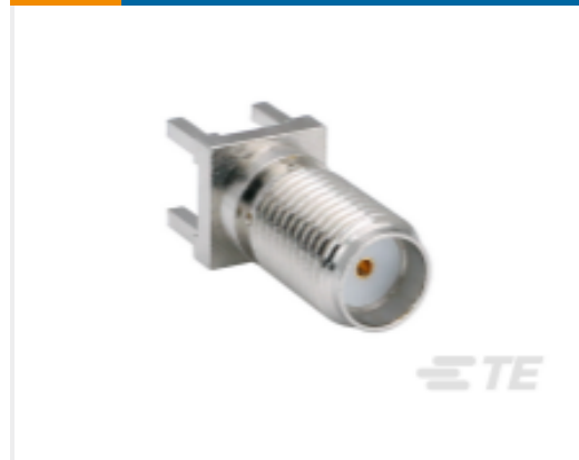
TE Part # CONSMA008 SMA Jack 50 Ohm PCB Through Hole