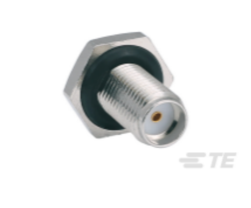
TE Part # CONSMA014-R178 SMA Jack 50 Ohm Cable Crimp Panel Mount