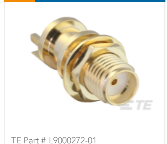
SMA Jack 50 Ohm .062 PCB Edge Mount