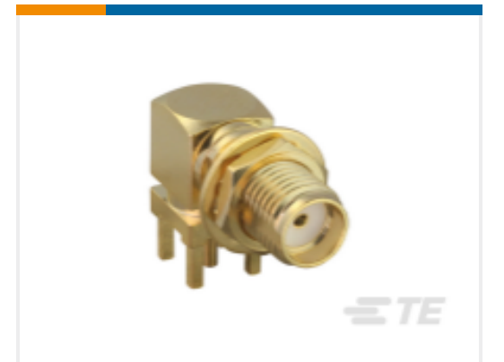
TE Part # CONSMA002-L-G SMA Jack 50 Ohm PCB Through Hole