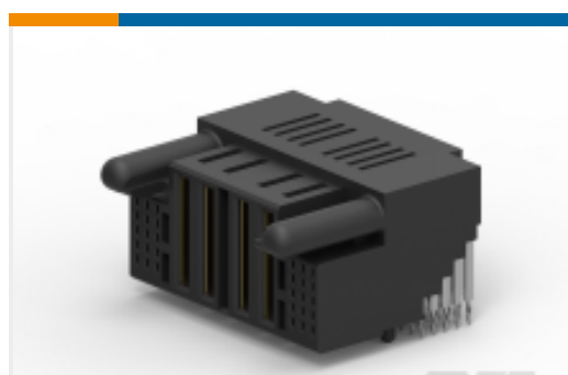
TE Part #2204400-1 MULTI-BEAM HD R/A REC. 15S+2P+2P+15S