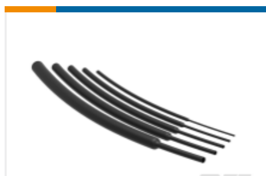
TE Part #NB19914001 VERSAFIT-1/16-0-SP