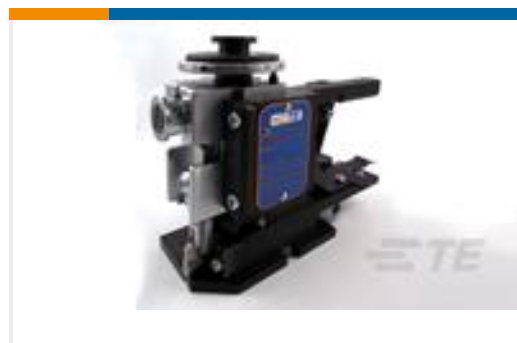
TE Part #2150008-1 OCEAN_2.0_Applicator-E-130F180F