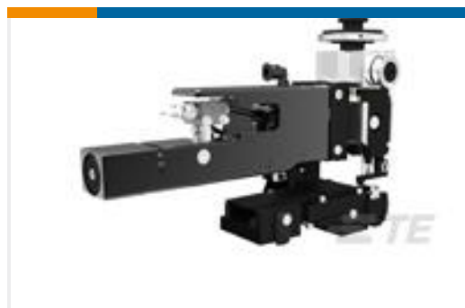
TE Part #2151034-2 OCEAN_2.0_APPLICATOR-S-1760