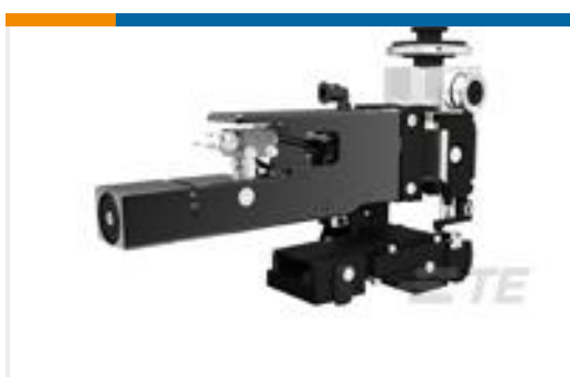
TE Part #2151032-2 OCEAN_2.0_APPLICATOR-S-205D