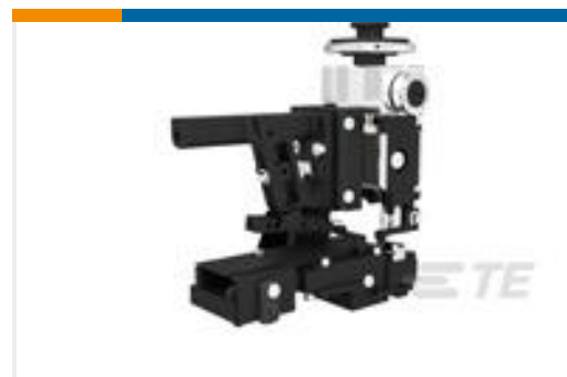
TE Part #2151030-1 OCEAN_2.0_APPLICATOR-S-062F110F