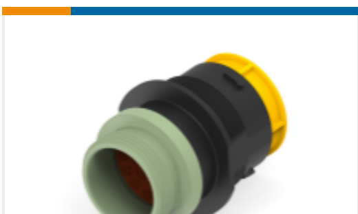
TE Part #HDP24-24-23PN-L015 REC, 23P, BLK, N, THD, 16, P