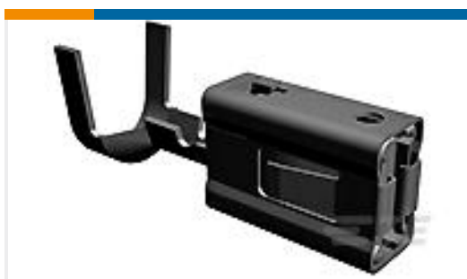
TE Part #1241414-1 AMP MCP 6.3/4.8K, CONTACT, SWS