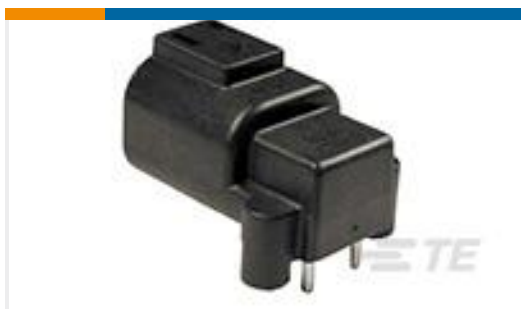
TE Part #DTF13-4P HDR, 4P, BLK, RA, SN/NI/CU