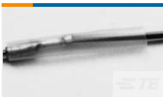
TE Part #CV21064001 RW-175-E-3/16-X-SP