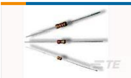
TE Part #2-1623928-8 CFR16 5% 4K7