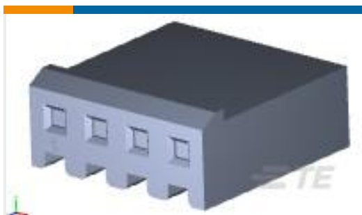
TE Part #647401-4 04P SL156 HSG W/RAMP,LRG OPEN