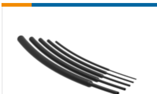
TE Part #NB13504001 RNF-100-3/8-BK-FSP