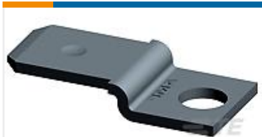
TE Part #42506-2 250 FASTON TAB TPBR