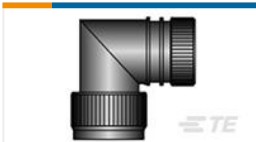
TE Part #289359-000 HEX40-AC-90-11-A2-1