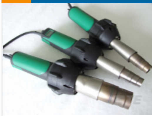
TE Part # EG1114-000 CV1981-ST-230V1600W-EU