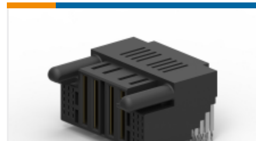
TE Part #2204400-1 MULTI-BEAM HD R/A REC. 15S+2P+2P+15S