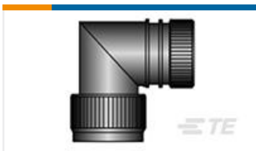
TE Part #289359-000 HEX40-AC-90-11-A2-1