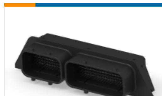
TE Part #2174100-2 CAP HOUSING ASSEMBLY 130POS 0.5 /1.0