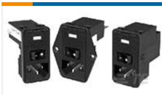
TE Part #6609109-1 PE000DL6C M0=C7001