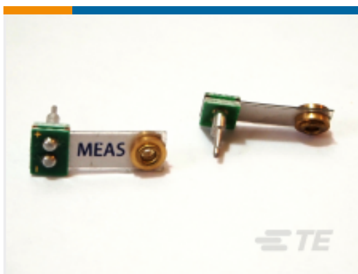
TE Part #1006015-1 LDTC-H,REDUCED HEIGHT