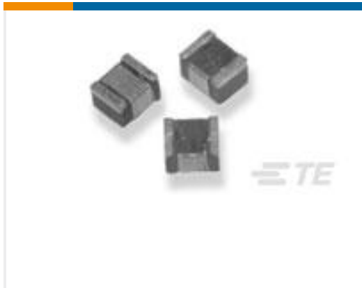
TE Part #5-1624113-7 3650 2A 0.33uH 5% 2K RL