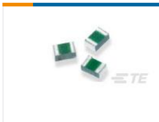
TE Part #1624360-2 NTC0805 5% 3K0