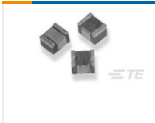
TE Part #4-1624113-8 3650 2A 0.12uH 5% 2K RL