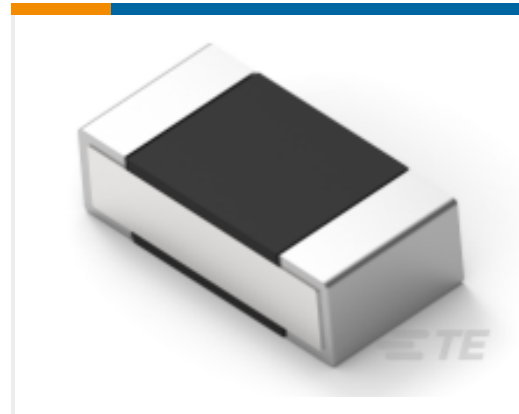
TE Part #4-2176306-6 RP 1E 0.1W 3K4 0.1% 25PPM 5K RL