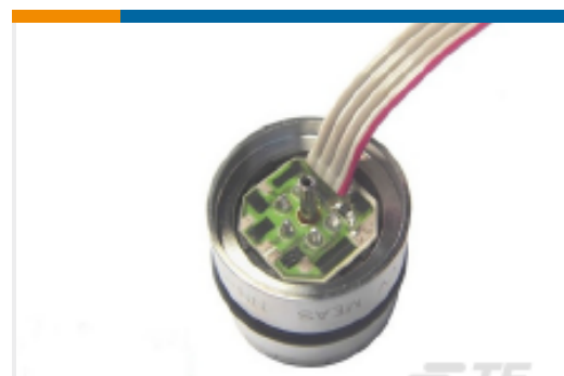
TE Part #154CV-001G-RT NISO,LP,CV,GA,R-CBL W/TUBE