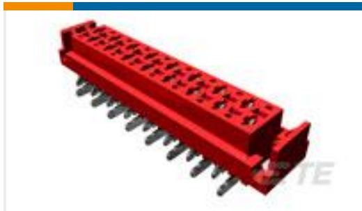
TE Part #338069-4 MICRO-MATCH SMD FTE