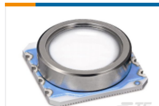
TE Part #MS580301BA07-00 MS5803-01BA07 1BAR FLUOROGEL TUBE