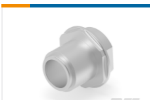
TE Part #225361-E MRDEZT M12 VERRIEG.SCHRAUBE 90GR SW16 *