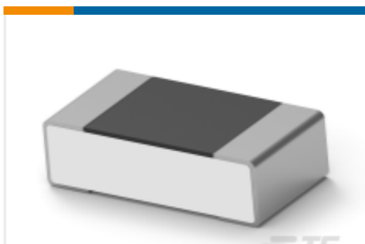
TE Part #8-2176371-6 RQ 0603 35K7 0.1% 10PPM 5K RL