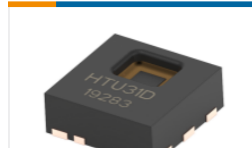
TE Part #10142048-22 HTU31D I.C 31D RH/T DIGITAL R5000 4kV