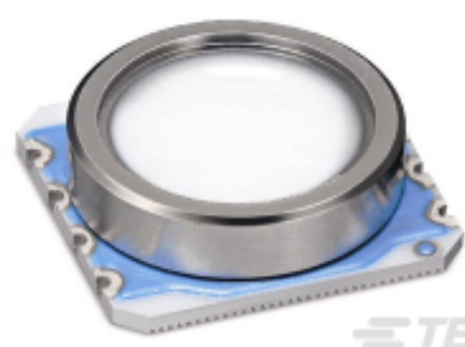
TE Part # MS580314BA01-00 MS5803-14BA01 DIGIT PRESSURE SENSOR TUBE