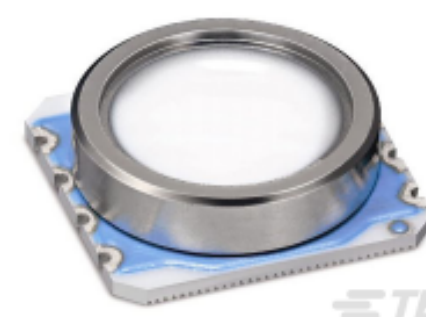
TE Part # MS580301BA01-00 MS5803-01BA01 PRESSURE SENSOR TUBE