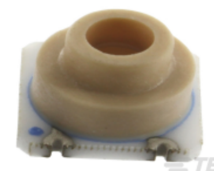
TE Part # MS580502BA01-50 MINIATURE DIGITAL PRESSURE SENSOR