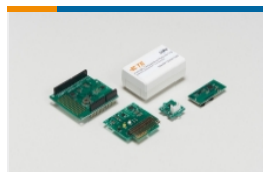
Sensor Development Boards and Evaluation Kits(1)