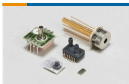
Board Mount Pressure Sensors(1)