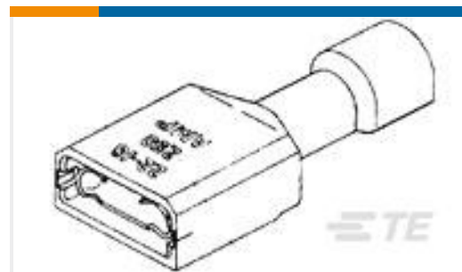
TE Part #2-520184-2 ULTRAFast 250 ASSY REC 22-18 TPBR LP