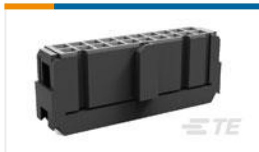
TE Part #1658621-3 16 NOVO MIL/CTR 15DP, LEAD FREE