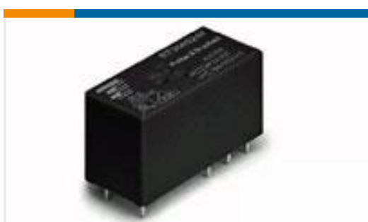
TE Part #4-1419108-0 RTE24005F