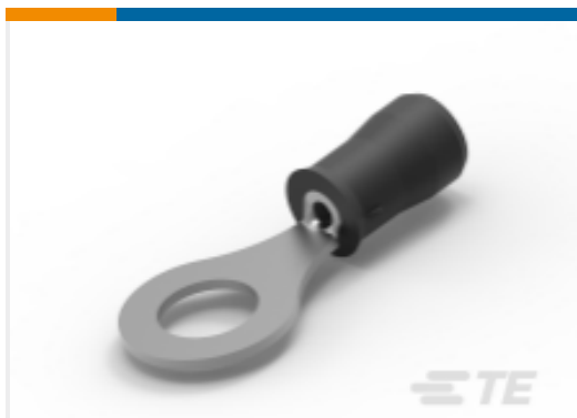
TE Part #36160 PIDG Ring Tongue Terminals