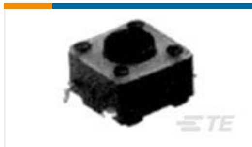
TE Part #3-1437565-0 FSM2JSMATR=ON T/R