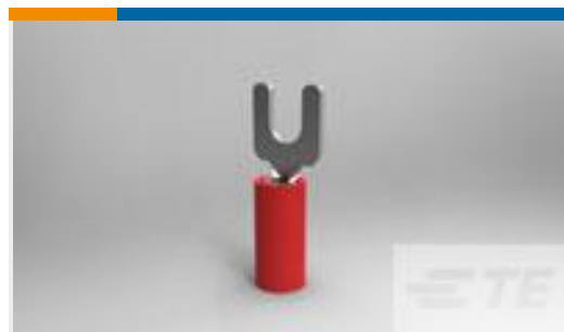
TE Part #34080 PIDG SPD 22-16 COMM 22-18MIL 6