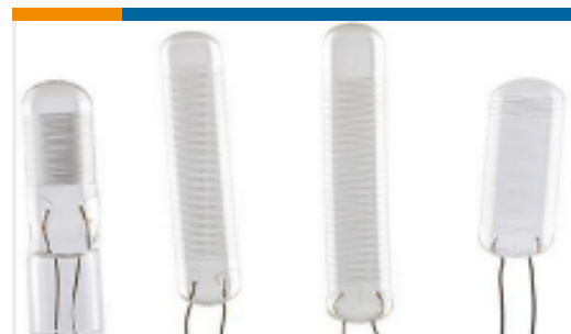
TE Part #32205074 GX518 1Pt100 W0.15 L5/D1.8mm