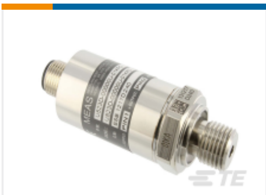
TE Part #U5244-000005-200PA PRESS XDCR U5244-000005-200PA