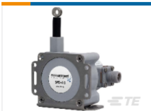
TE Part #SPD-25-3 STRING POT 25 INCH RANGE