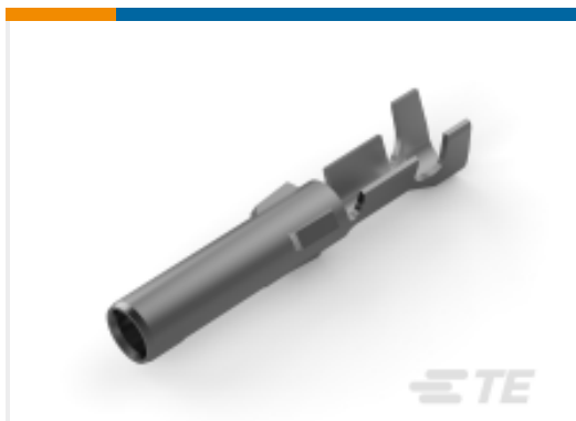
TE Part #2029185-1 CMNL SKT W/INDENTED SIDES