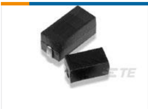
TE Part #3-1879022-7 SMF3 10K 5%