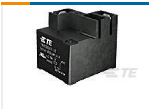
TE Part #2-1419104-1 T9AS1D22-24