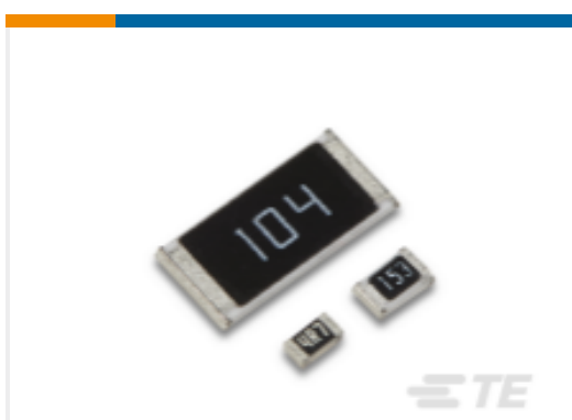
TE Part #1-2176343-1 CRGCO 1206 68R 1%