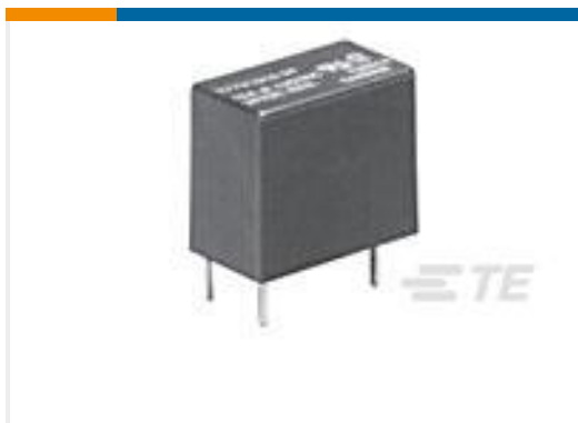
TE Part #1393194-9 T77S1D10-12