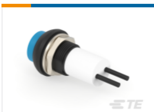
TE Part #2329358-5 PB OFF/ON HC BLU M1 TERM IP68 500MM L