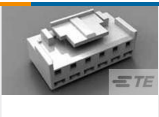
TE Part #1-1123722-2 3.96 EP PLUG HSG 2P(NATURAL)