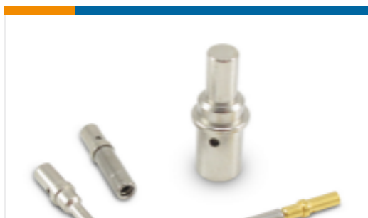
TE Part #0462-201-16141 DEUTSCH Solid Contacts