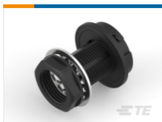
TE Part #2213858-1 RECEPTACLE ASSEM., LUMAWISE ENDURANCE S