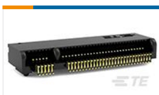
TE Part #1-2199119-5 M.2 0.5PITCH 3.2H KEY M 15U" AU