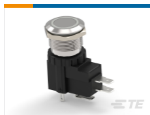
TE Part #1-2364570-4 AVH19 FLT SS LK RNG GRN 12V16A