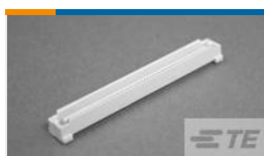
TE Part #5177984-3 0.8FH,P05H.5,080,08/Sn,TU