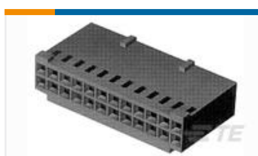
TE Part #280366 AMPMODU II REC. HSG DUAL ROW, 16 POS.