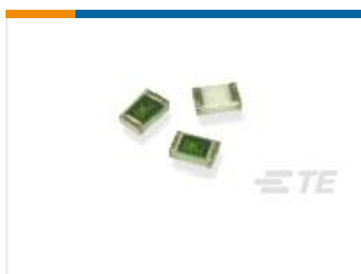
TE Part #1676347-2 RN 0805 46K4 0.1% 10PPM 1KRL