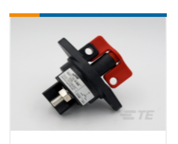
TE Part # CAT-AL4-SBD353001 Battery Disconnector, 300A, 1 Pole