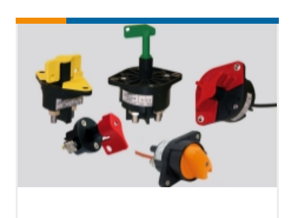
Battery Disconnect Switches(166)