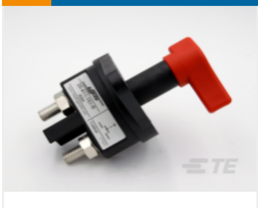
TE Part # CAT-AL4-SBD354001 Battery Disconnector, 400A, 1 Pole