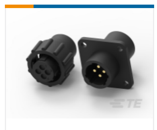
TE Part #211400-1 Cable/Panel Mount Connector, CPC Series 1