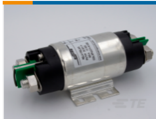
TE Part #K1060611 Power Relay, 300A, Standard, Monostable, DC