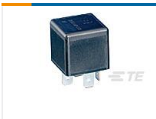
TE Part #3-1393303-7 V23134B1053C642-EV-CBOX