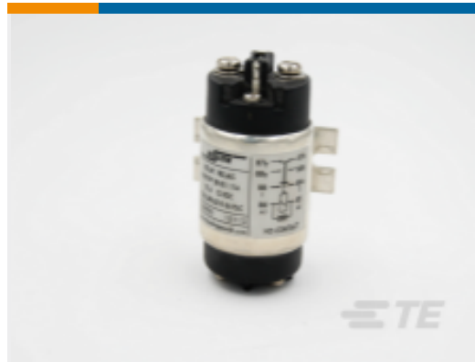
TE Part #K1126416 Relay 29-011-12A