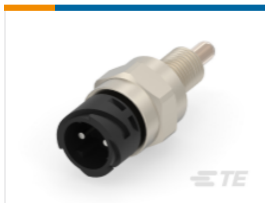
TE Part #K1150149 Plunger Switch 44-01-051