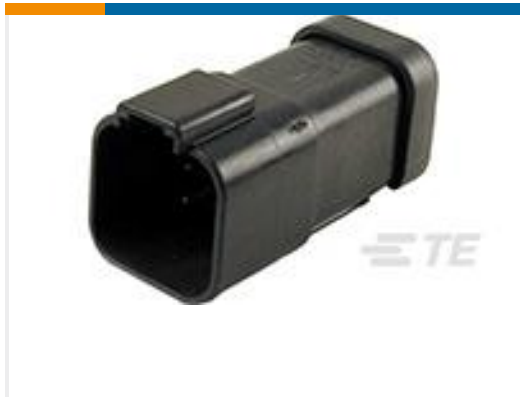
TE Part #DT04-6P-EP14 REC, 6P, BLK, BUSBAR 2X3, NICKEL