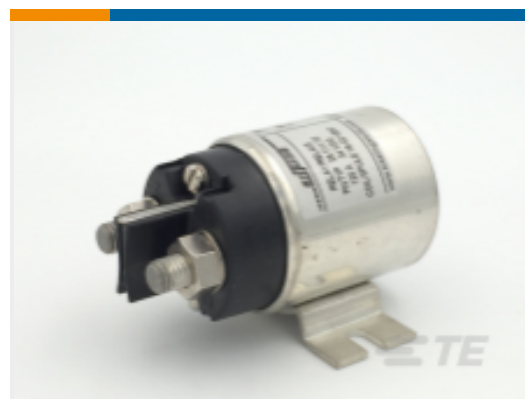
TE Part # CAT-AL6-KSPR29120 Power Relay, 120A, Standard, Monostable, DC