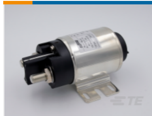
TE Part #K1131955 Relay 29-511-12A