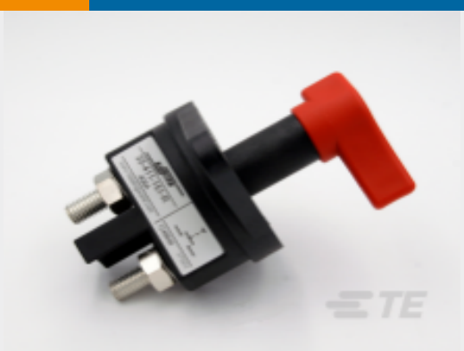
TE Part #K1121363 Battery Disconnect 35-413-151-R