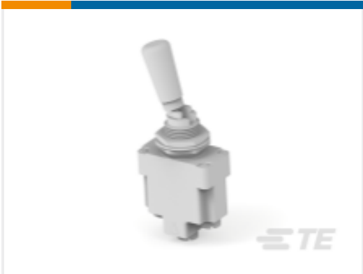
TE Part #K1159062 Toggle Switch 07-2-2-13 D 936