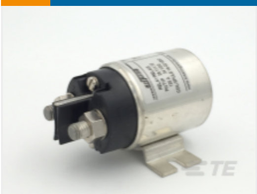
TE Part #K1060487 Relay 29-111-11