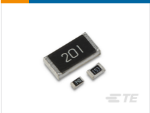
TE Part #3-2176329-4 CRGP 1210 5K6 1%