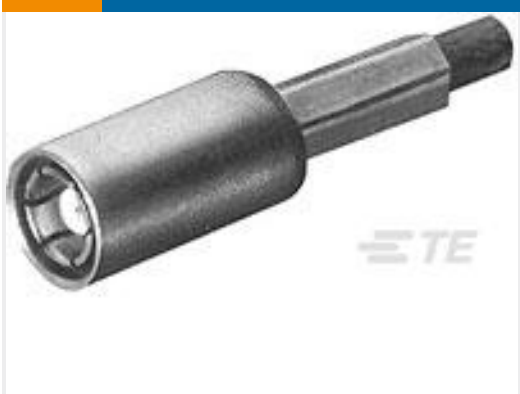
TE Part #413985-1 PLUG ASSY,STR,SMB