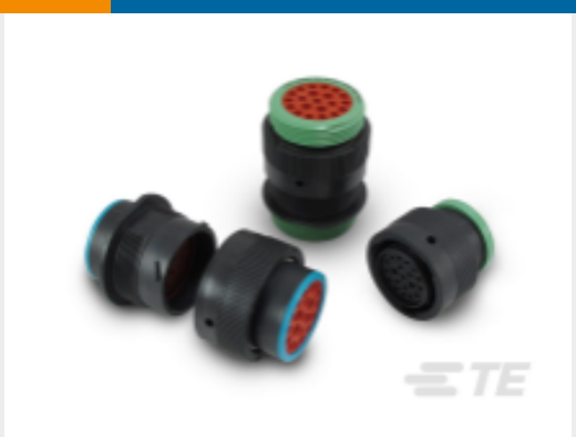
TE Part #HDP26-18-14SE DEUTSCH HDP20 Housings