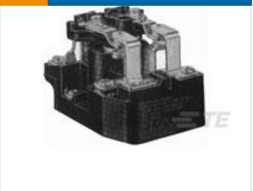
TE Part #1393127-9 PRD-11AG0-120=PRD