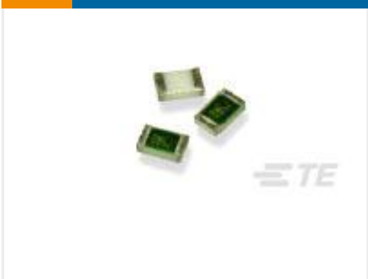
TE Part #7-1614894-7 CPF0805 2M0 0.1% 25PPM 5K RL