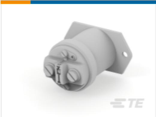
TE Part #K1008006 Relay 26-71-01