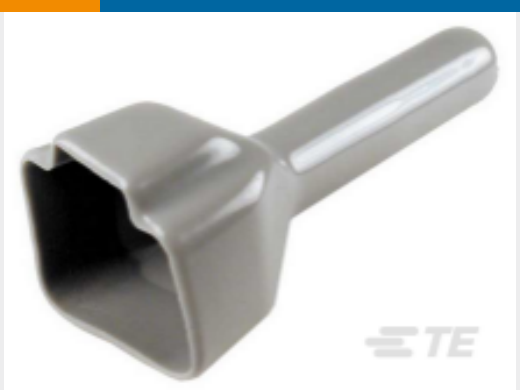
TE Part #DTP4S-BT BOOT, 4P, PLG, ST, GRY