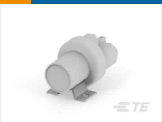
TE Part #K1014846 Relay 26-57-01