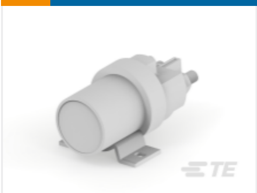
TE Part #K1009421 Relay 26-08-08