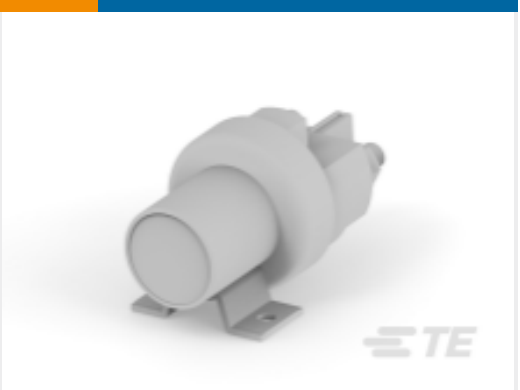
TE Part #K1008699 Relay 26-60-05