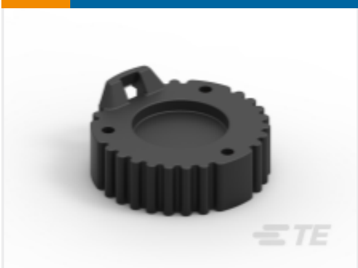
TE Part #HDC16-9-E004 DUST CAP ASM