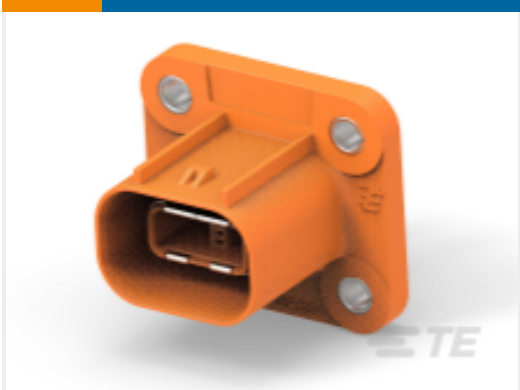
TE Part #1-2103124-2 HEADER ASSY, Ag SHIELD, KEY B, HVA280-2P