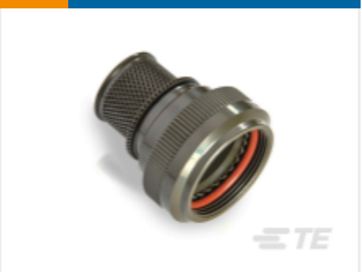
TE Part #EK4824-000 91H1-09-04-1-B-HE050