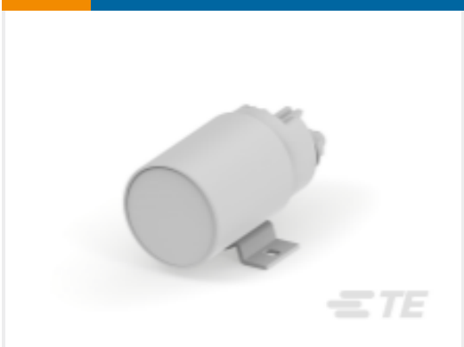
TE Part #K1002385 Relay 29-211-02