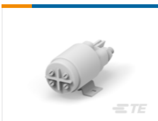
TE Part #K1146697 Relay 31-311-12-S-P-A