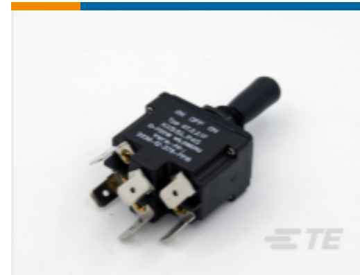
TE Part #K1002983 Toggle Switch 07-2-2-17