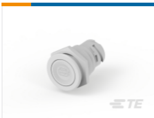
TE Part #K1145244 Push button switch TS-211-RT62