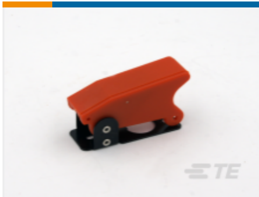
TE Part #K1022530 Switch guard 07-0-0-01