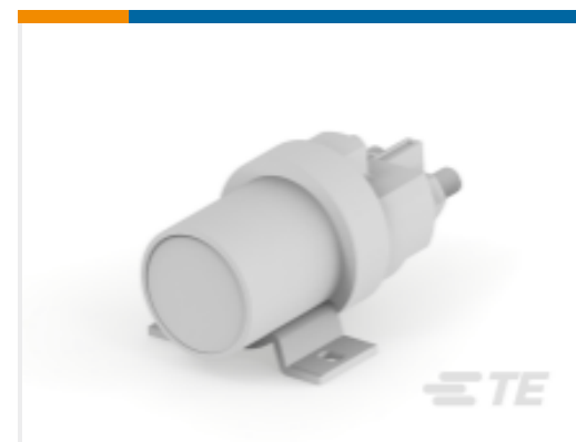
TE Part #K1009421 Relay 26-08-08