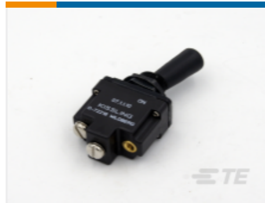
TE Part #K2015512 Toggle Switch 07-1-1-10