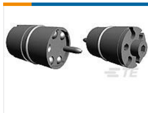
TE Part #1515740-1 INSERT ASSY, 4 X 1310/1550 SM, JR